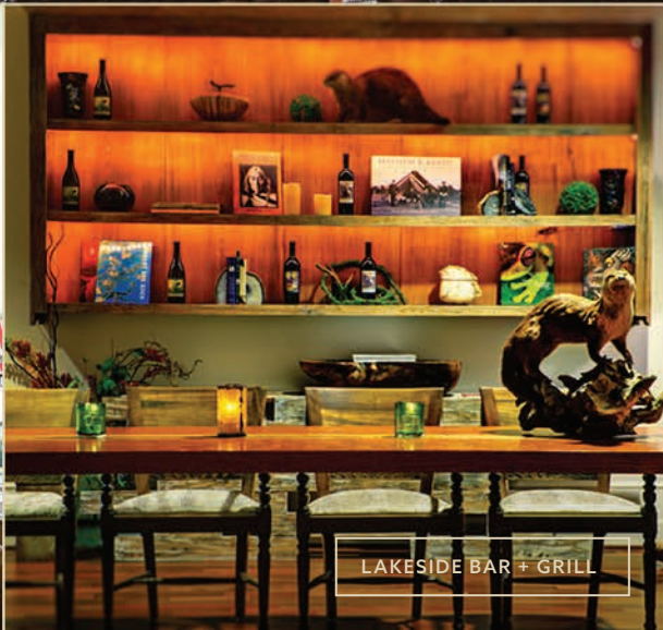
LAKESIDE BAR + GRILL