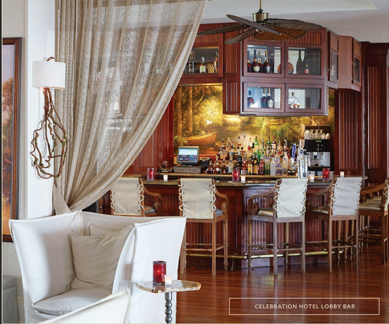
CELEBRATION HOTEL LOBBY BAR

From the lobby that greets you to the guest room you rest in and every hallway in between, we invite you to pause for a second, find what raises your pulse, try something different and share these moments together. Celebration delivers a hotel and art gallery full of original pieces, a spa experience, live and curated music, incredible dining and destination adventures, all in one stay. Add any of these to the schedule and your day becomes much more than a meeting.