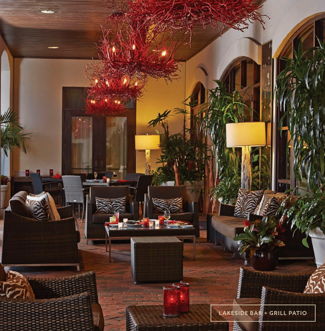
LAKESIDE BAR + GRILL PATIO