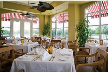
LAKESIDE BAR + GRILL