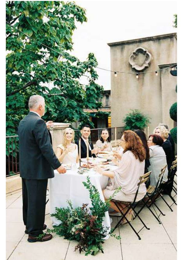
TERRACE AT PATIO DEL NORTE