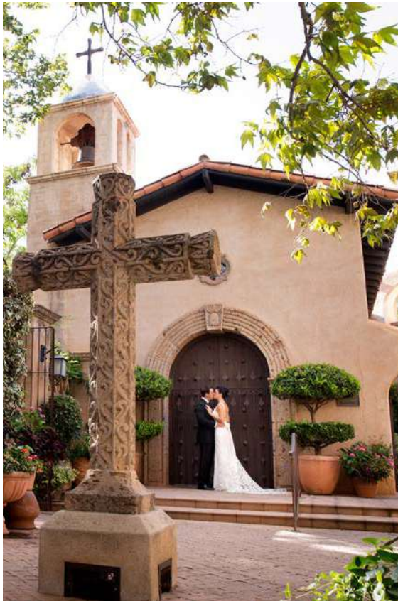
CHAPEL AT TLAQUEPAQUE