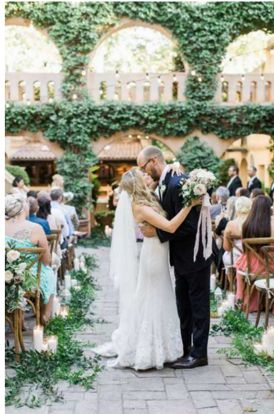
PATIO DE LAS CAMPAÑAS