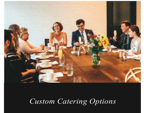
Custom Catering Options

Hotel Saranac, newly restored in heart of the Adirondacks, is steeped in history and surrounded by breathtaking views. Your special day will be made magical by the flexibility of our unique event spaces and offerings, customizable catering menus, on-site amenities including a salon, Barber, spa, and more!