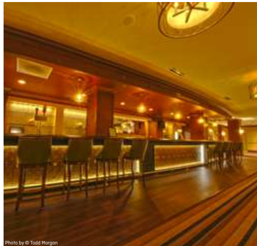
Budweiser Kiel Club Cocktail Reception