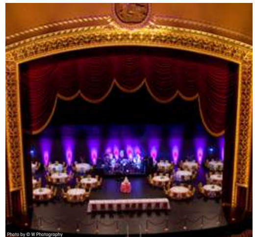
Grand Theatre Reception: 300 Max Seated Capacity