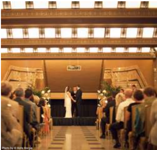
Ticket Lobby Ceremony: 300 Max Seated Capacity