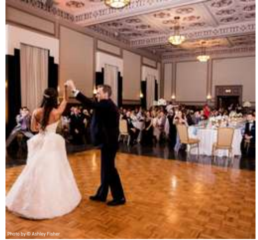
Ballroom Reception: 225 Max Seated Capacity