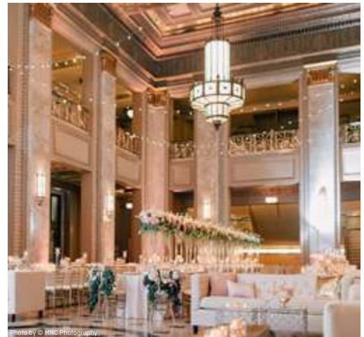
Grand Lobby Reception: 350 Max Seated Capacity