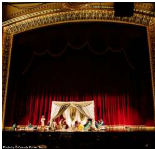
Main Theatre Ceremony: 300 Max Seated Capacity