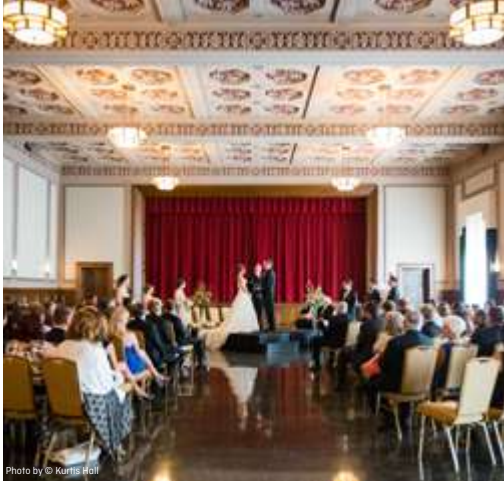
Ballroom Ceremony: 225 Max Seated Capacity