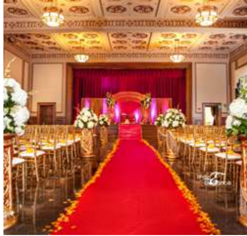
Ballroom Ceremony: 225 Max Seated Capacity