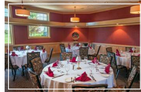
The Orchard Room