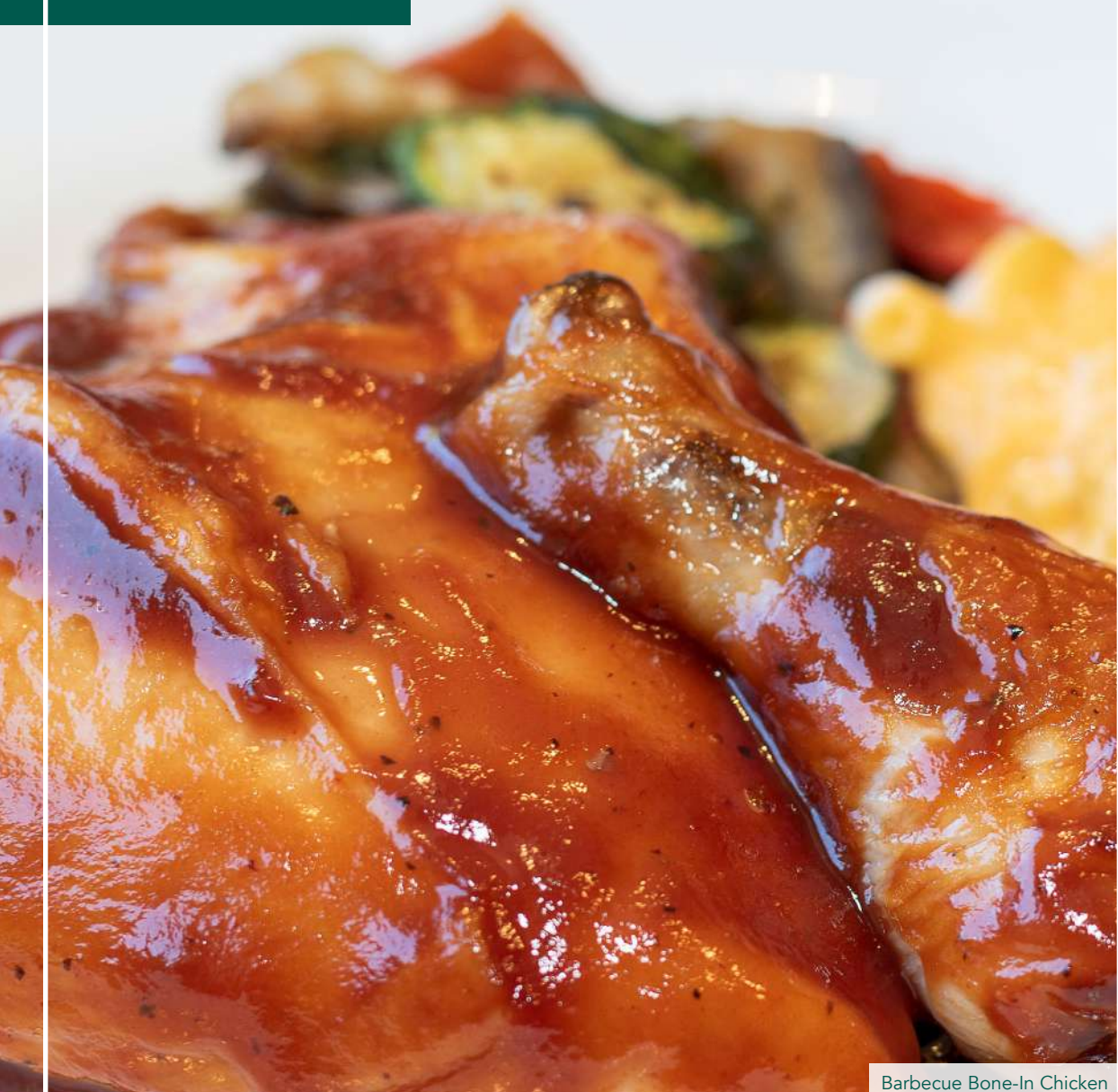
Barbecue Bone-In Chicken

Includes choice of side dishes, cornbread muffins or warm rolls and fountain beverages.