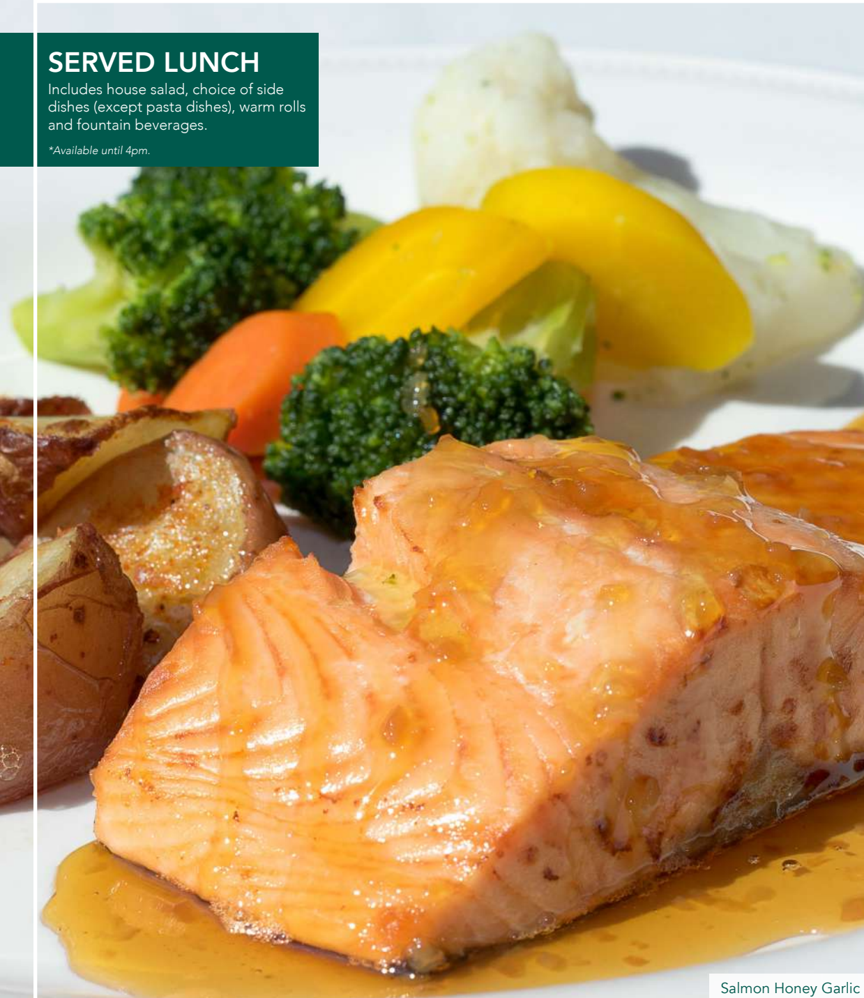
Salmon Honey Garlic