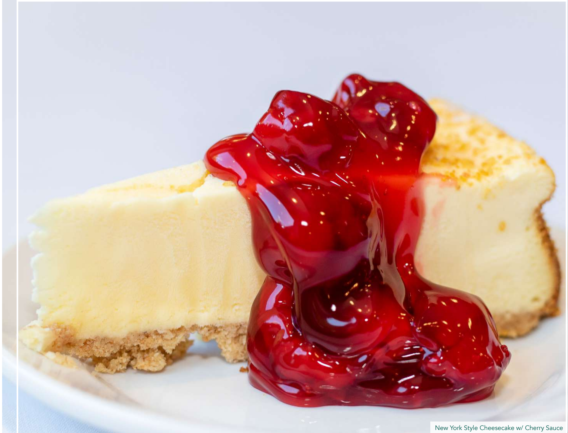
New York Style Cheesecake w/ Cherry Sauce

• Service fee for outside cakes is $1 per person.