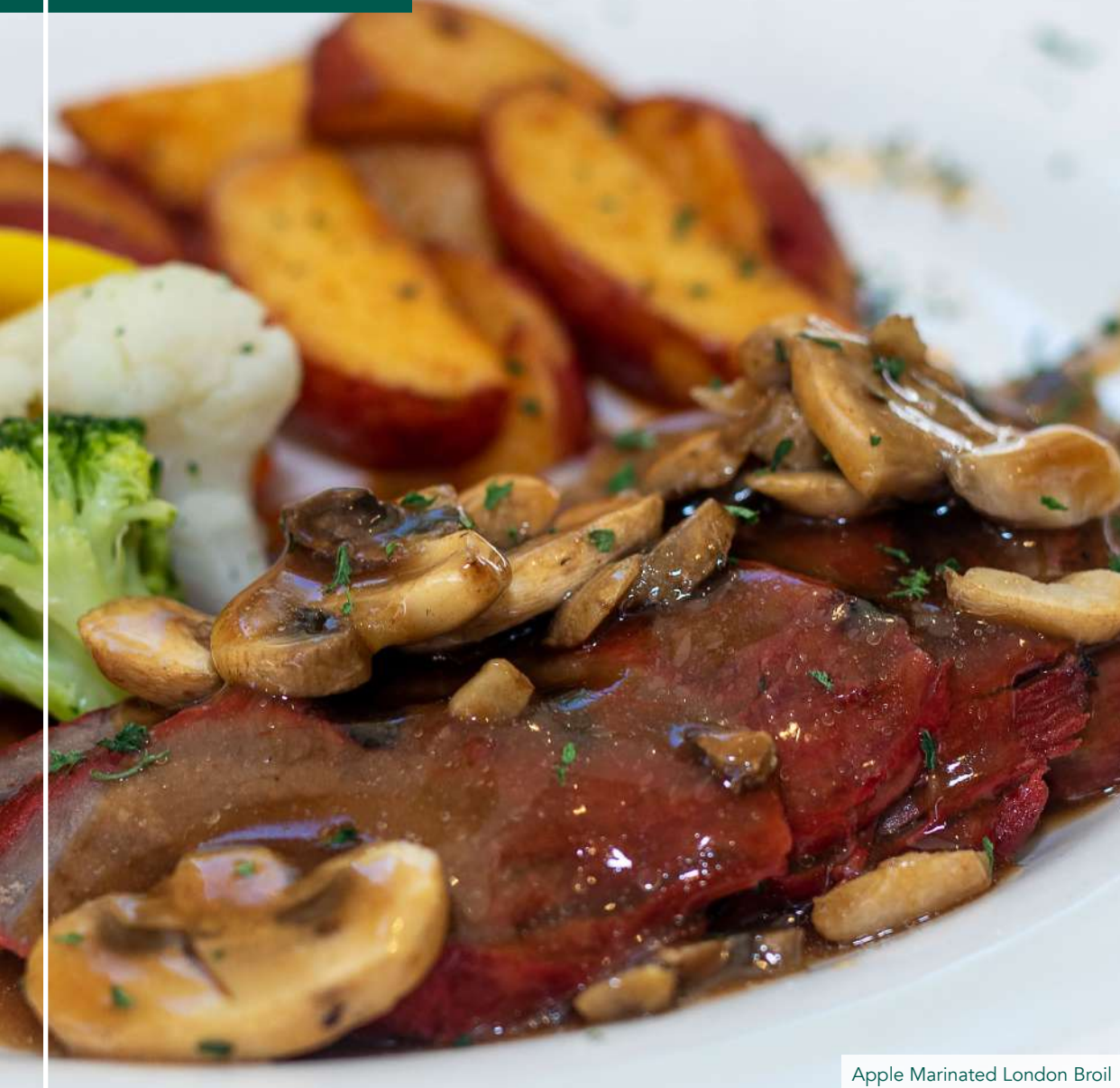
Apple Marinated London Broil