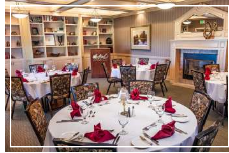
The Club Room

Kathleen's offers small event spaces in a relaxed setting with beautiful views.