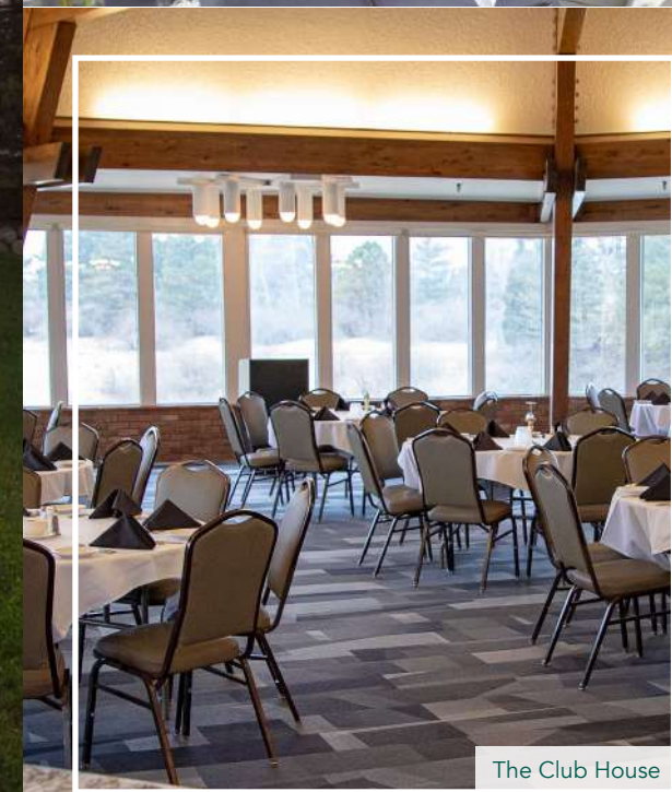
The Club House