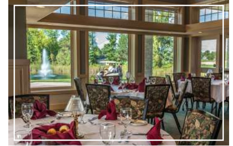
The Fountain Room