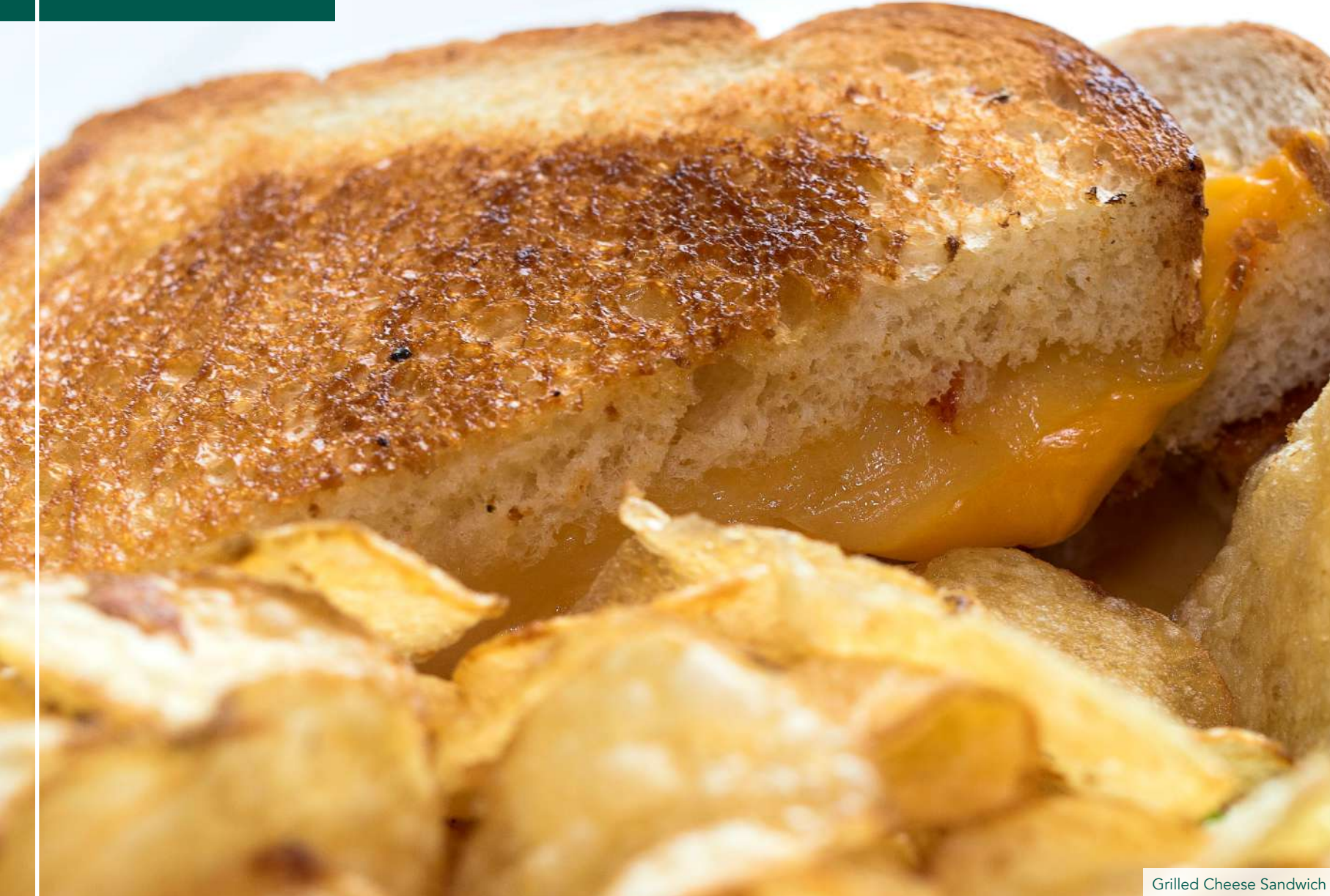
Grilled Cheese Sandwich