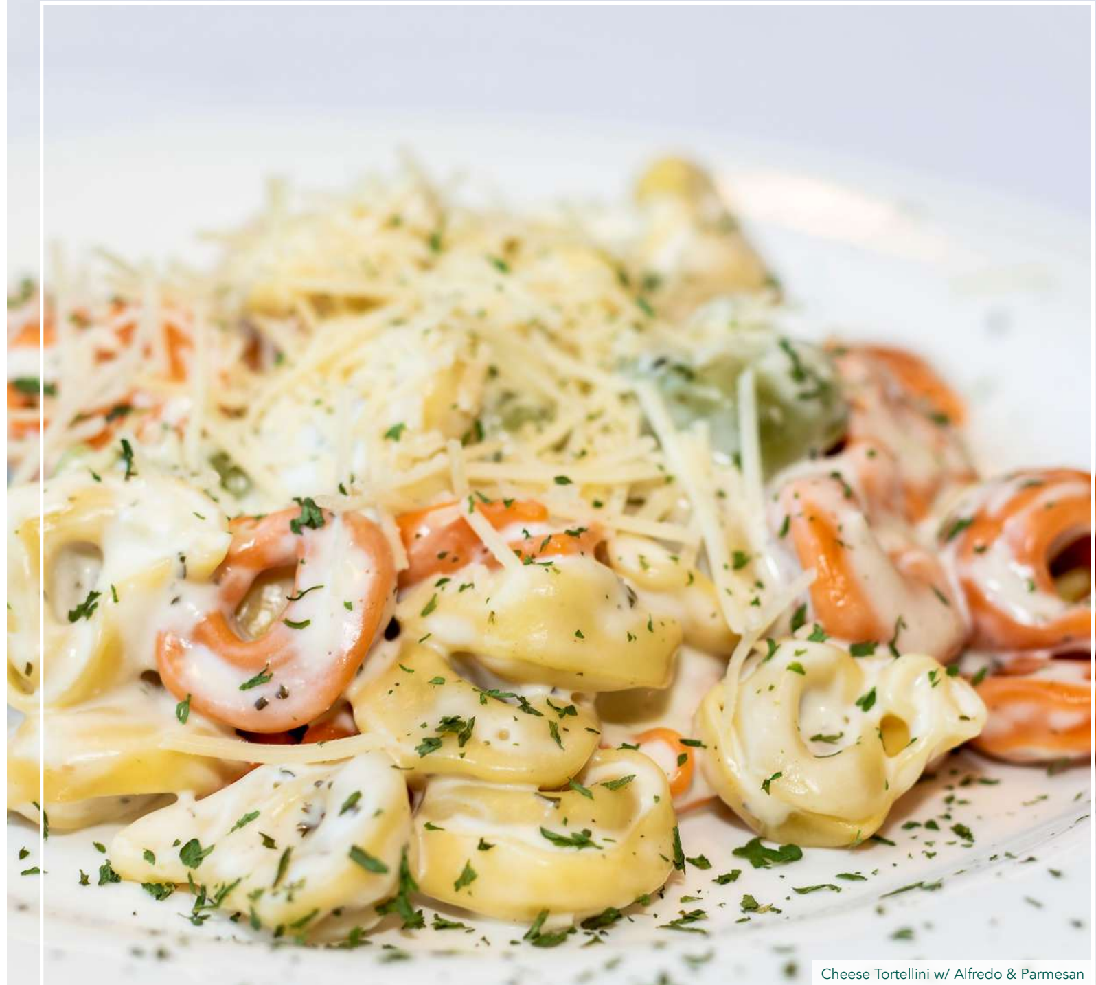
Cheese Tortellini w/ Alfredo & Parmesan