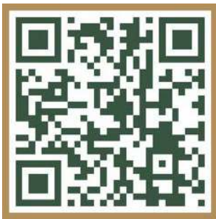
SCAN FOR A VIRTUAL TOUR