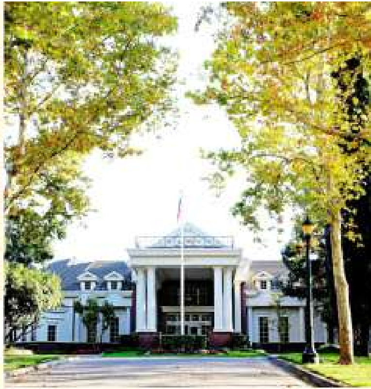
BROOKSIDE COUNTRY CLUB