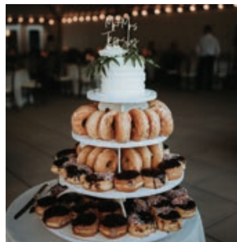
Solich Photo & Film