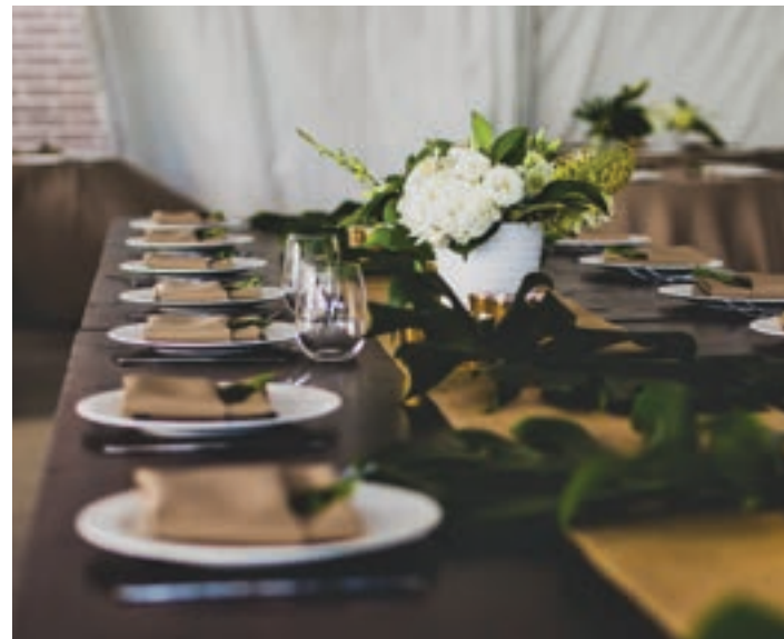
Ryan Zarichnak Photography