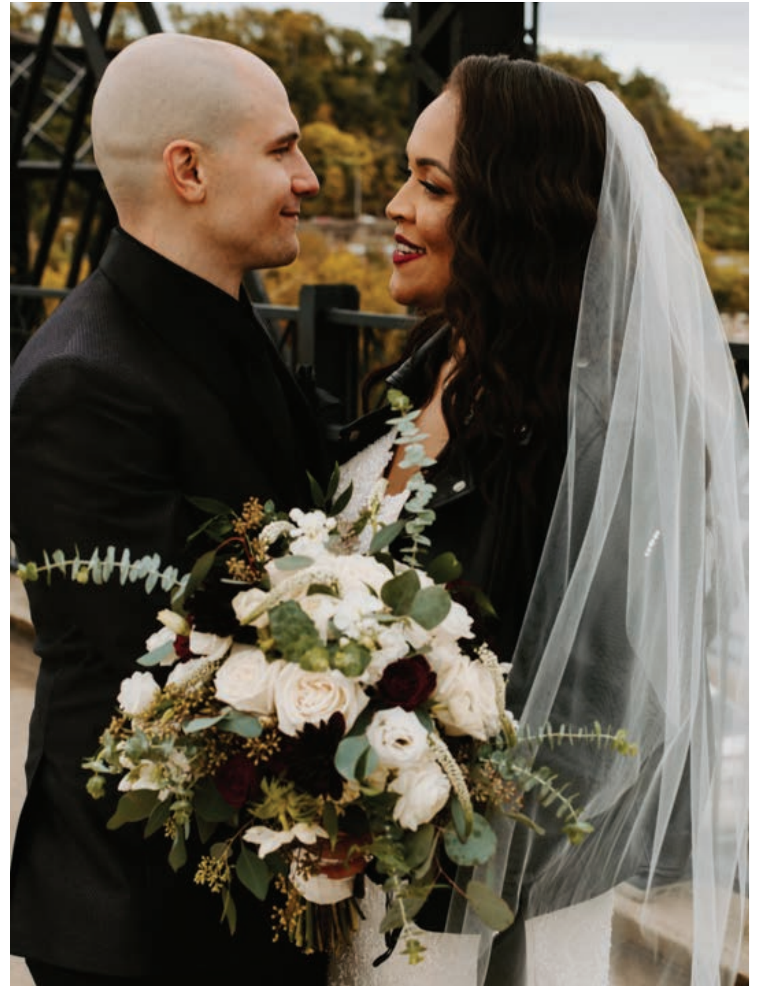
River Rose Weddings