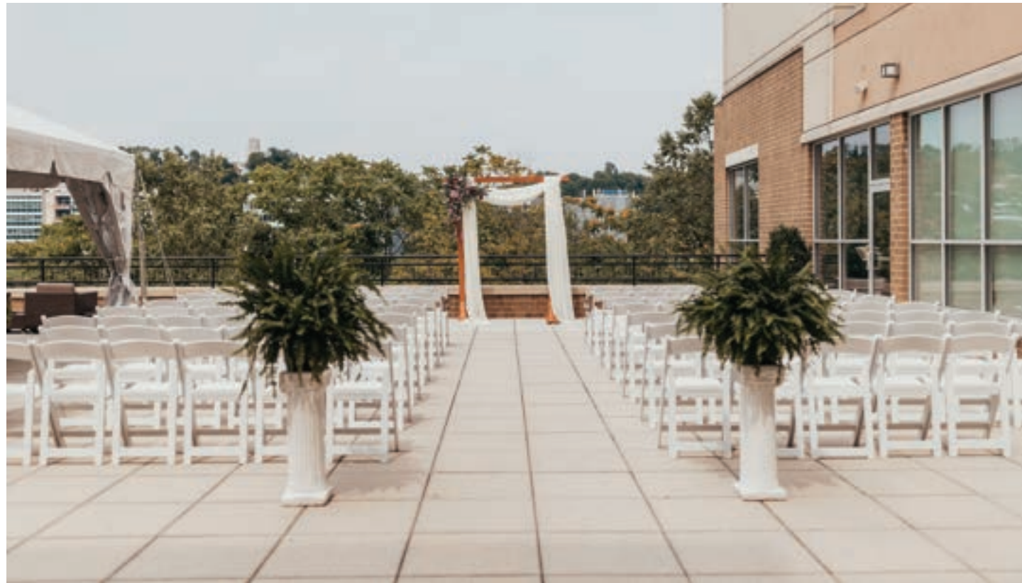
Alyssa Vanston Photography