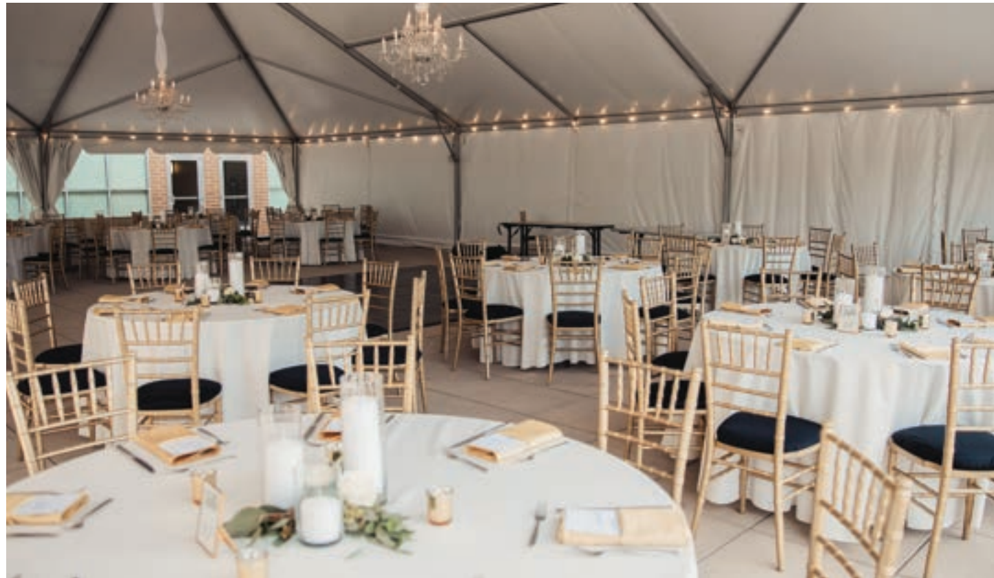
Wild North Weddings