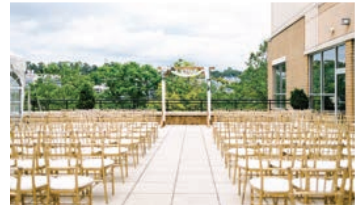
North Arrow Photography