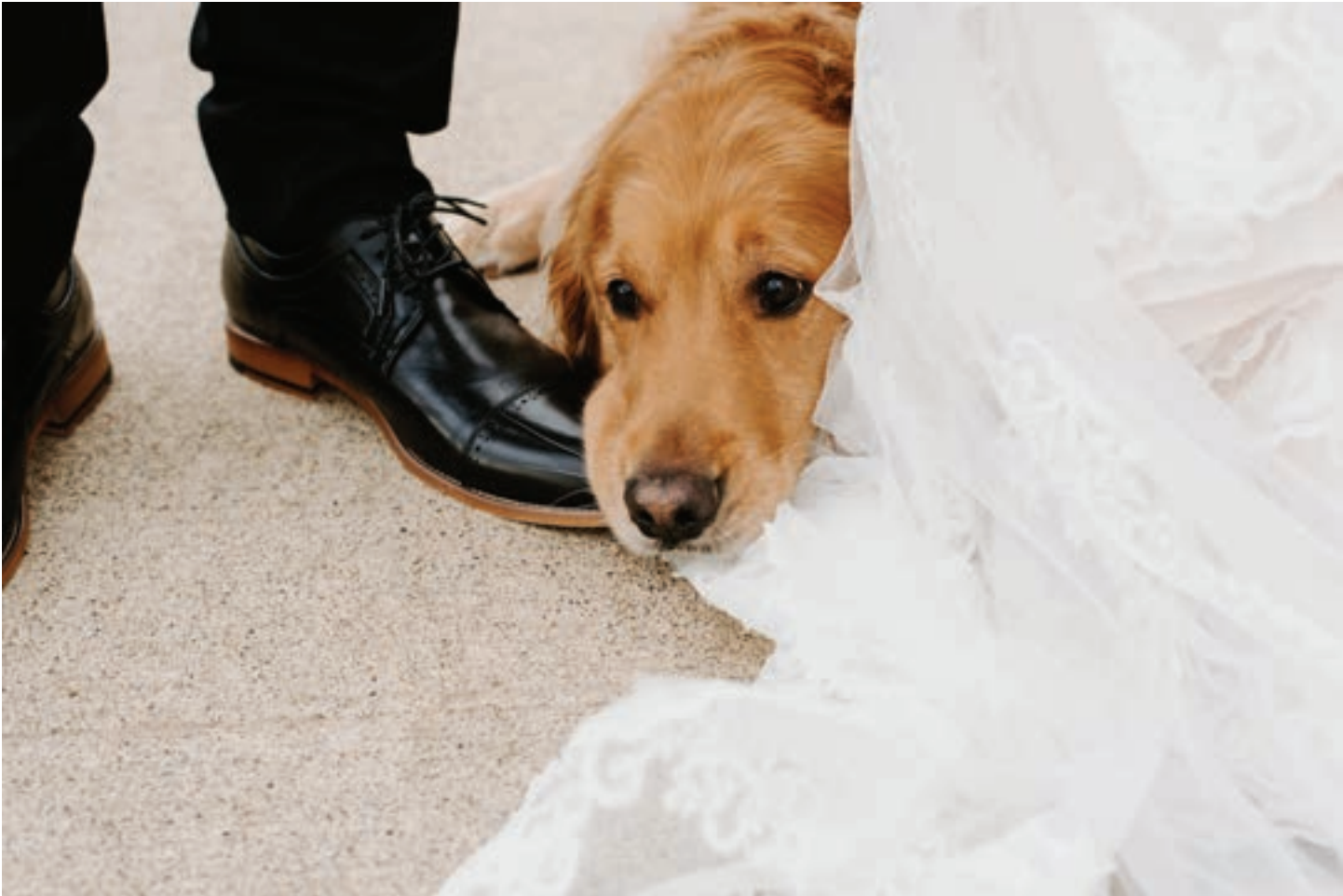
River Rose Weddings