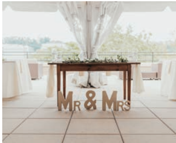
Alyssa Vanston Photography