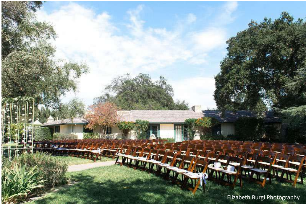
Elizabeth Burgi Photography