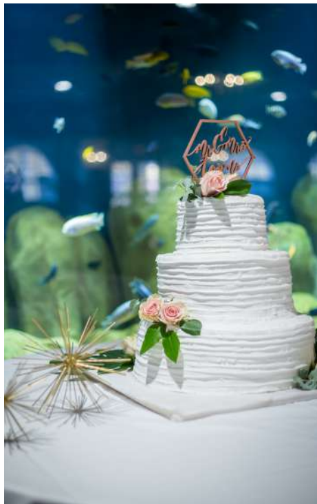
Malawi: Toledo Zoo & Aquarium