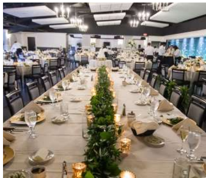
Malawi: Toledo Zoo & Aquarium