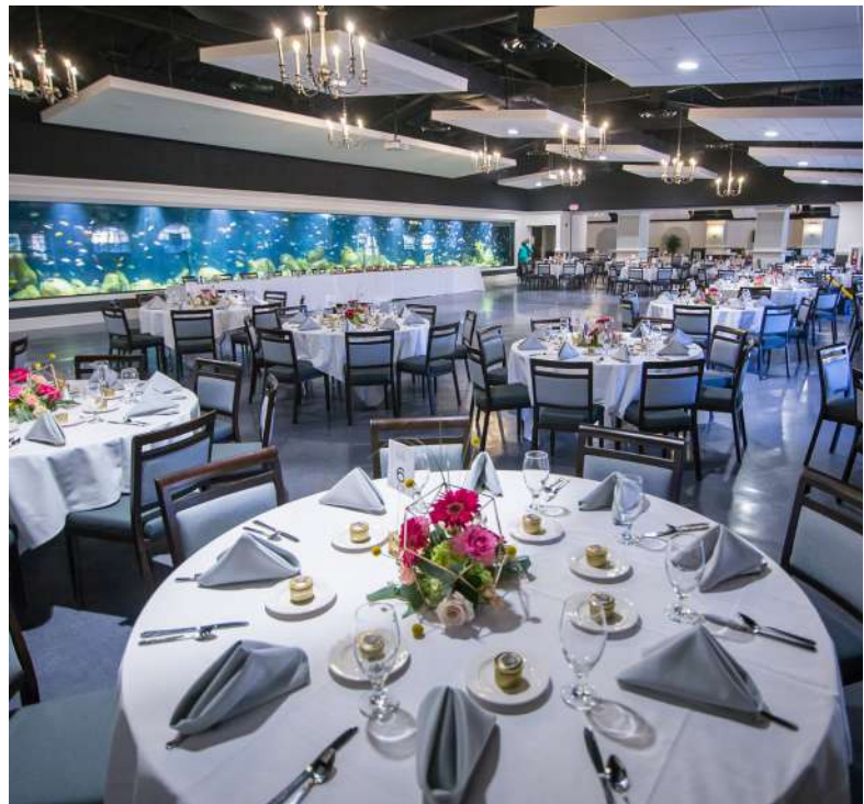
Malawi: Toledo Zoo & Aquarium