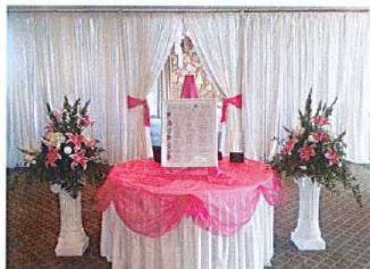
FABRIC DRAPING AVAILABLE DRAPING COVERING THE WOOD PILLARS IN THE LOBBY (PRICE BASED ON SELECTION)