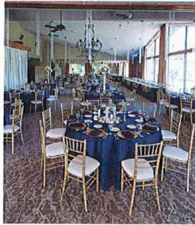
CHIVARI CHAIRS SILVER OR GOLD w/ CUSHION - $6.25 PER CHAIR ADDITIONAL OPTIONS AVAILABLE (PRICE BASED ON SELECTION)