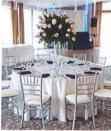
FLOOR LENGTH LINENS AVAILABLE (PRICE BASED ON SELECTION)