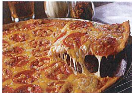
LATE NIGHT SNACK WHITE CASTLE CRAVE CASES OR AURELIO'S PIZZA WE WILL ORDER, PICK-UP AND SERVE (PRICE BASED ON QUANTITY OF FOOD)