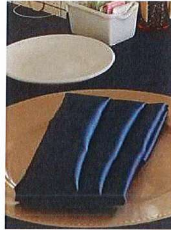
SATIN NAPKINS & TABLE RUNNERS MANY COLOR OPTIONS AVAILABLE