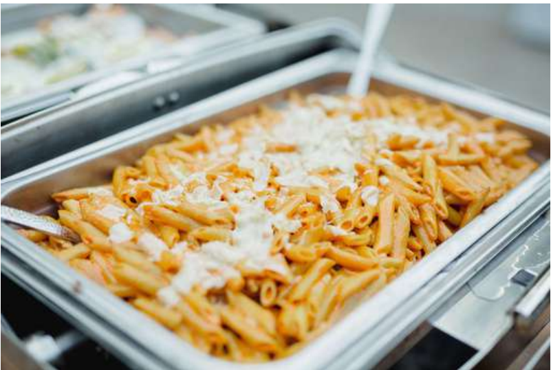
Penne Pasta w/ Cajun Cream Sauce