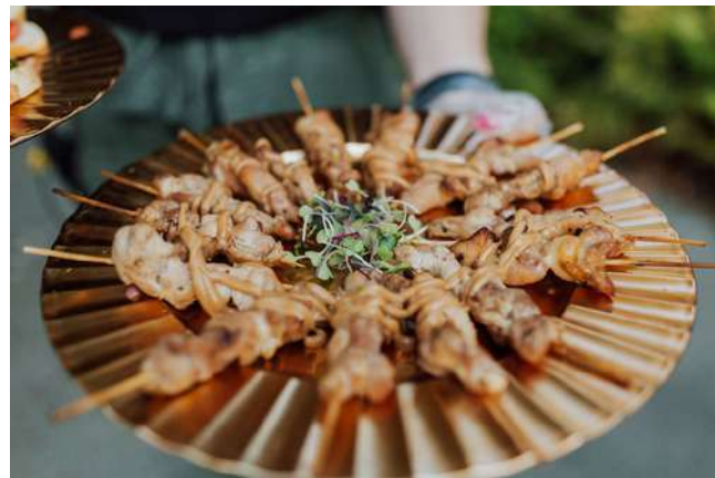
1. Grilled Skewered Chicken drizzled with a Thai Peanut Sauce