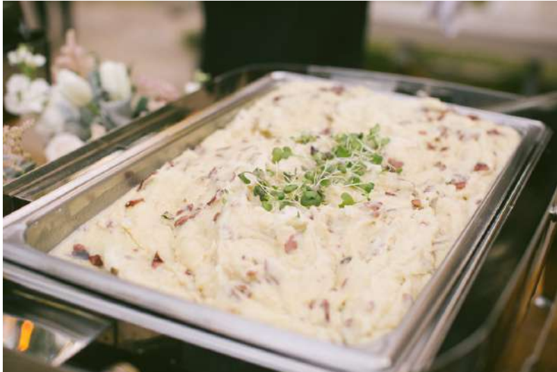
Roasted Garlic Mashed Potatoes