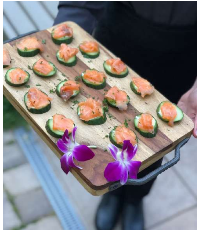
6. Smoked Salmon Served on a Japanese Cucumber Slices with a Wasabi Aioli