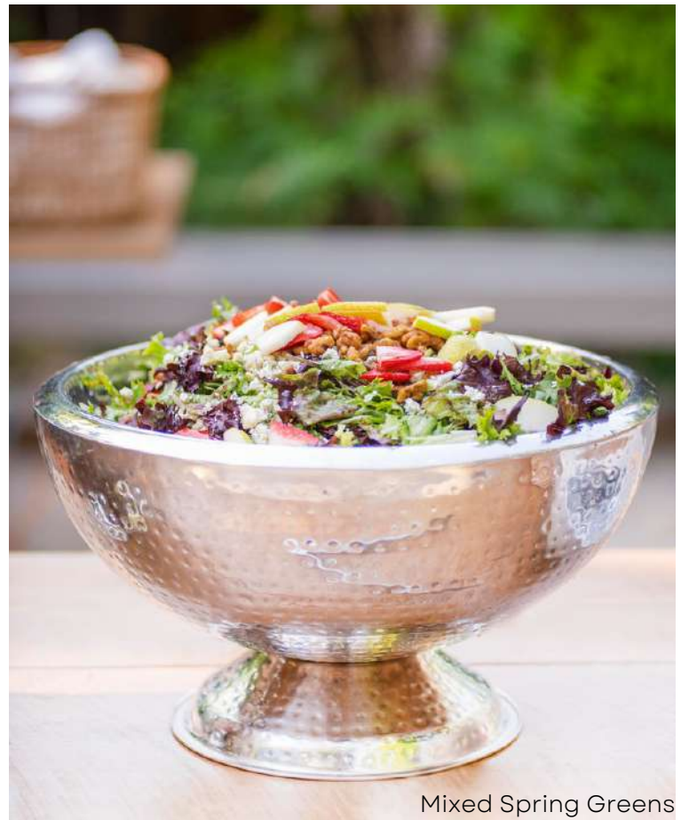
Mixed Spring Greens

Baby Spinach with sliced almonds, dried cranberries, sliced red onions & mandarin oranges tossed in a honey Dijon dressing.