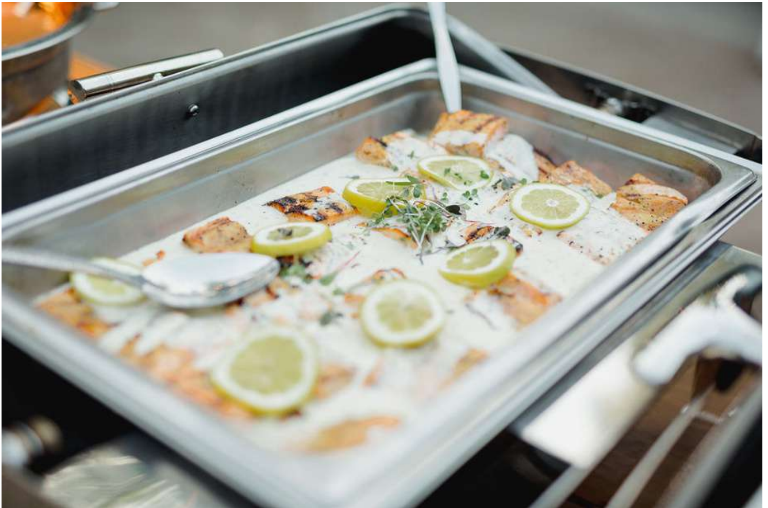
Grilled Salmon Fillet