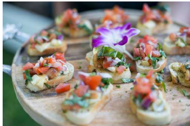
4. Baked Brie Bruschetta with Roasted Garlic