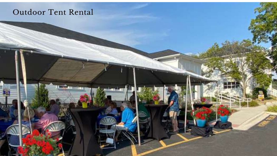
Outdoor Tent Rental

With a capacity of 100 people, you have the freedom to provide the food, entertainment, tables, and chairs to suit your special event.