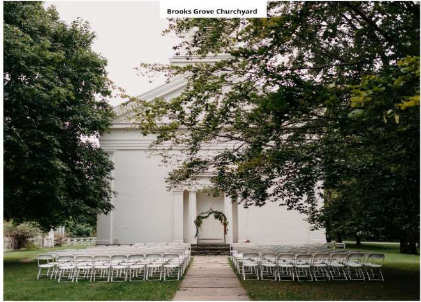
Brooks Grove Churchyard