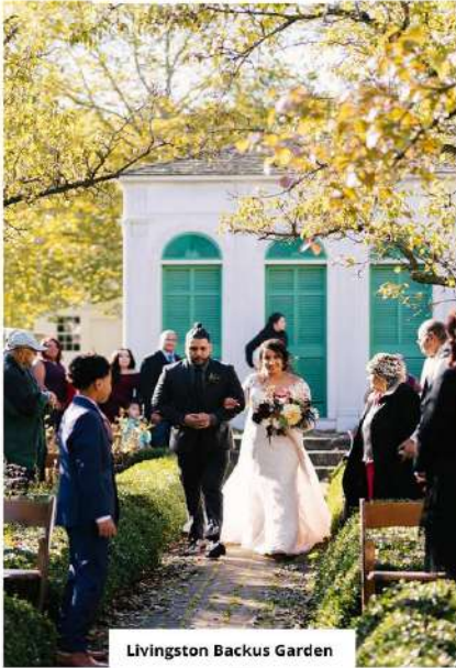
Livingston Backus Garden