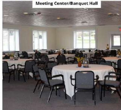
Meeting Center/Banquet Hall