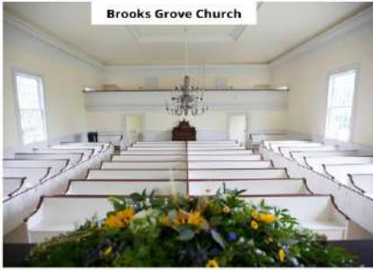
Brooks Grove Church