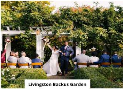
Livingston Backus Garden