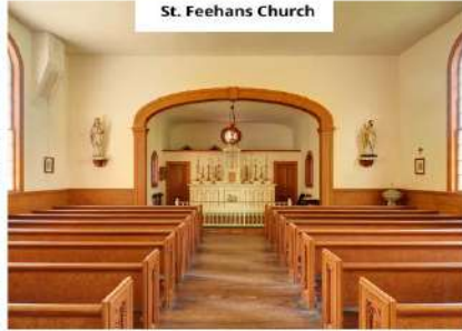
St. Feehans Church