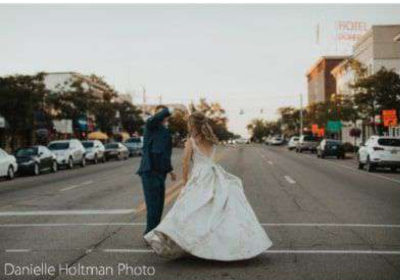
Danielle Holtman Photo