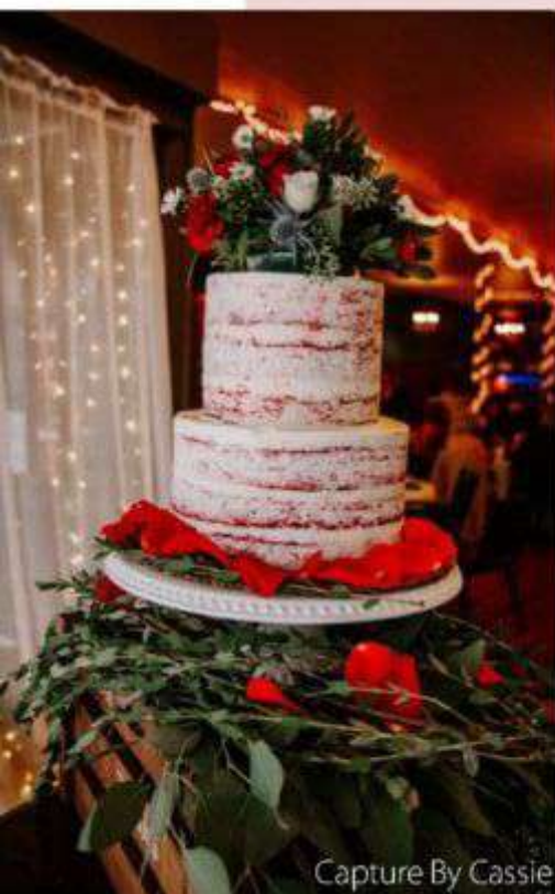
Capture By Cassie