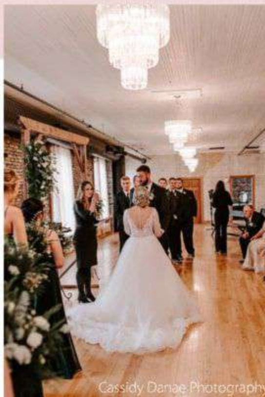
Cassidy Danae Photography