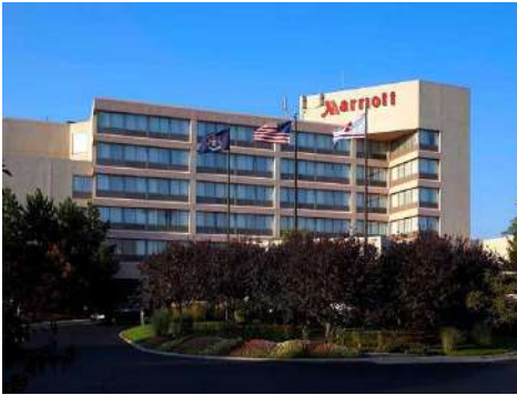
DETROIT MARRIOTT LIVONIA