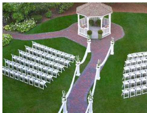
GAZEBO - OUTDOOR CEREMONY