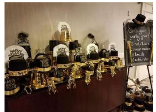
GRAND BALLROOM FOYER