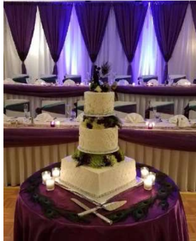
WEDDING RECEPTION - HEAD TABLE & CAKE TABLE