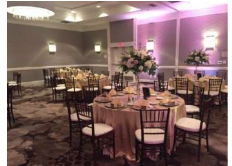
GRAND BALLROOM - CHIVARI CHAIRS