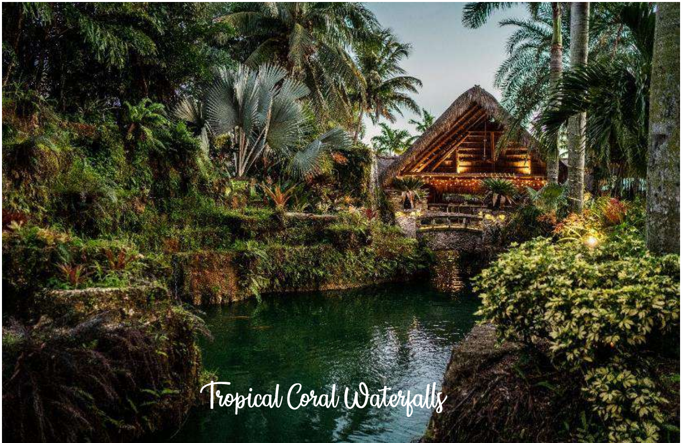
Tropical Coral Waterfalls