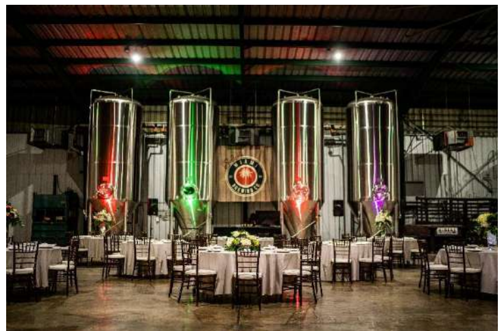
Miami Brewing Co's Taproom