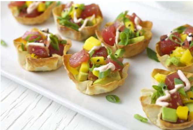
AHI TUNA BITES