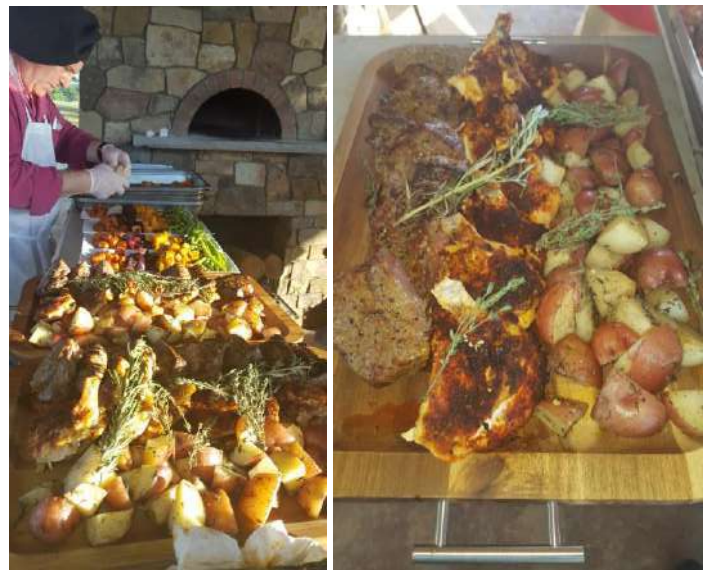
FAMILY STYLE PLATTERS