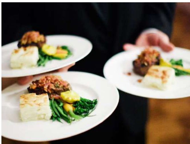
PLATED DINNER SERVICE