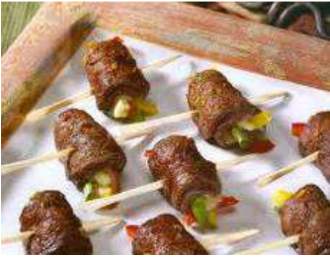
HIBACHI BEEF SKEWERS