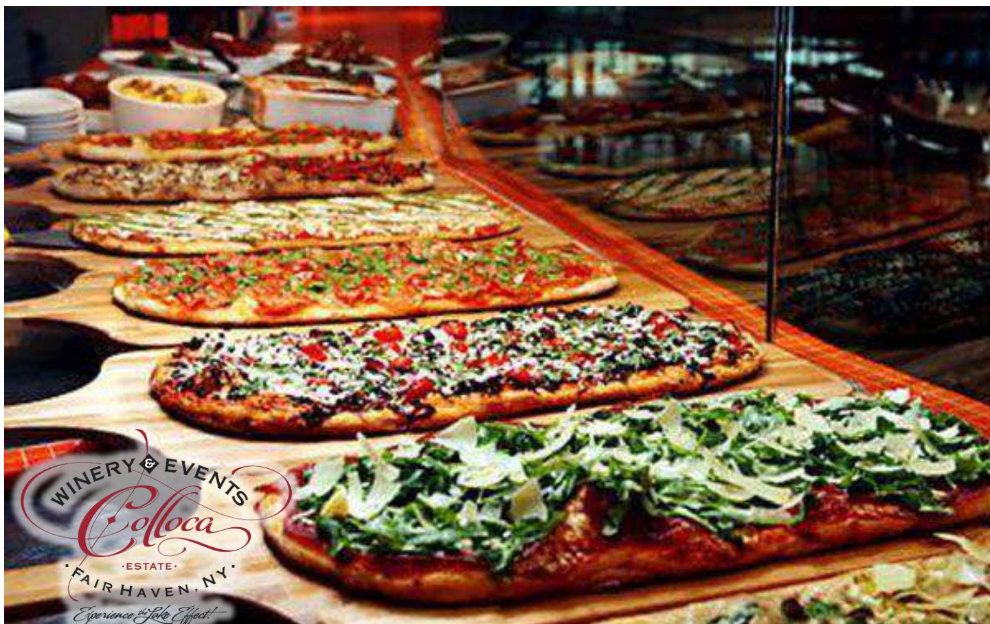
WOOD FIRED PIZZA

BAKED POTATO BAR $7.95 WITH CHICKEN, BACON, PULLED PORK, GREEN ONION, BUTTER, CHEDDAR CHEESE, AND SOUR CREAM