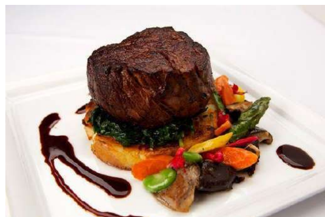
PLATED FILET MIGNON OF BEEF