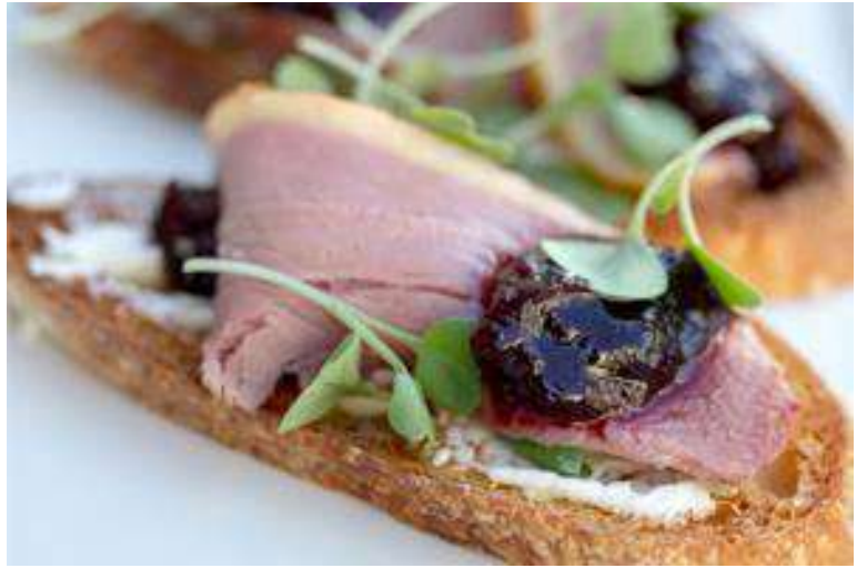
SMOKED DUCK BREAST CROSTINI