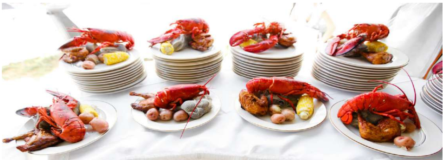
LAKE EFFECT VINEYARD® LOBSTER BAKE AT COLLOCA ESTATE WINERY