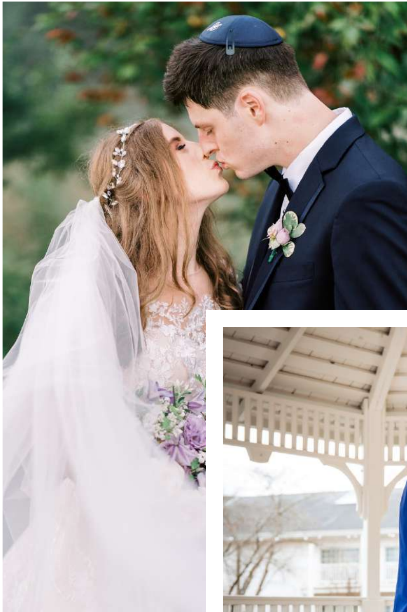
@daisyzimmerphoto @laurenleephoto @sethandbethphoto