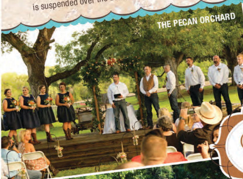
THE PECAN ORCHARD

"The Jewel of the Ranch" - Seating up to 150 guests with a 2,000 sq. ft. deck shaded by a 500 year old Pecan tree, that allows for an additional 50 guests. The Lily deck is suspended over the banks of the Cibolo overlooking the lighted river and waterfall.