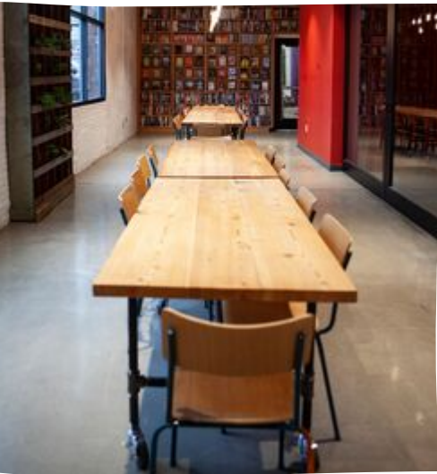
6' X 2' INDUSTRIAL PIPE AND WOOD TABLES

REQUEST OUR COMPLETE LIST AND PRICING GUIDE.