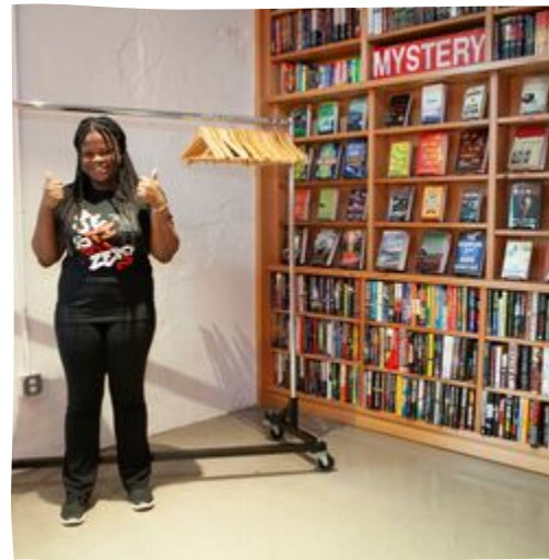
COAT RACKS AND WOODEN HANGERS