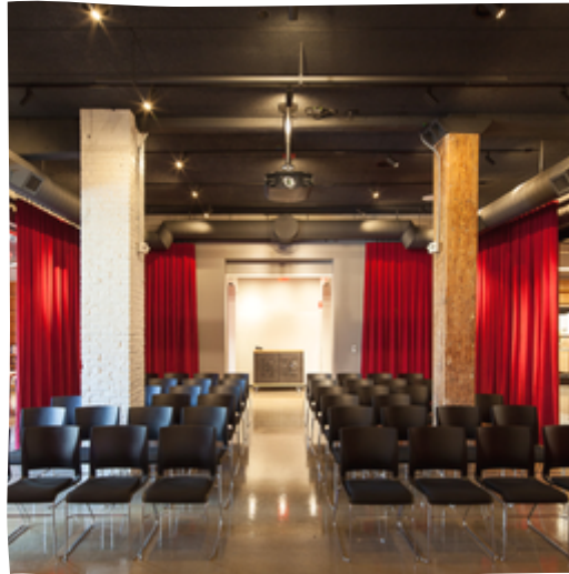
BLACK THEATER CHAIRS