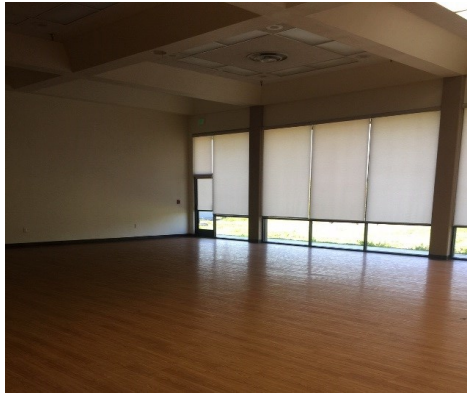
BANQUET ROOM UPSTAIRS UP TO 275

MUSIC MUST END AT 9:30 PM SHARP / PARTY MUST END AT 10:00PM NO LIVE MUSIC or BANDS ! ( Unless approved ) SORRY NO EXCEPTIONS !