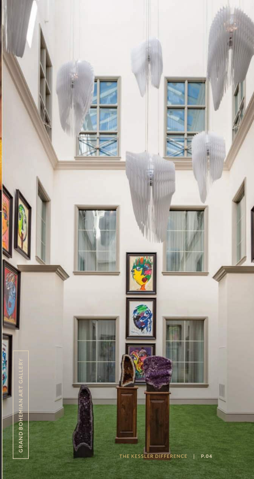
GRAND BOHEMIAN ART GALLERY

What matters to you, happens here. While you plan your meeting down to the tiniest detail, we leave the doors open for the unexpected. That's why you could add things like a rooftop lunch or an art gallery happy hour in your contract. Or a Wine Blending Experience to your agenda. You can expect that your event will be just as planned. You can only imagine what else we can bring to inspire or simply render your guests speechless. If you're tempted to try something remarkable, you're in great company. The only people as dedicated to your event as you, are our passionate Grand Performers who deliver it.