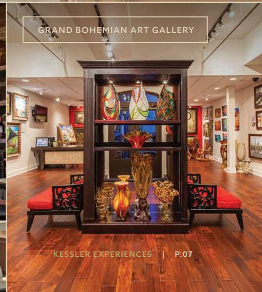
GRAND BOHEMIAN ART GALLERY