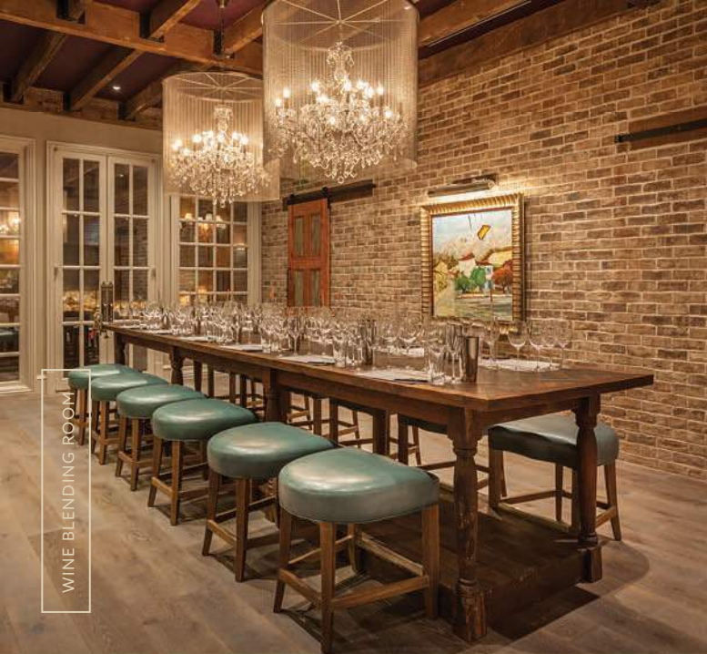
WINE BLENDING ROOM