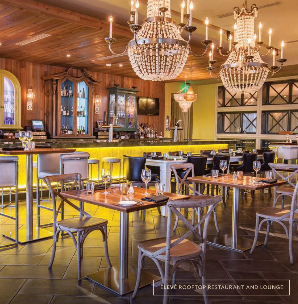
ÉLEVÉ ROOFTOP RESTAURANT AND LOUNGE