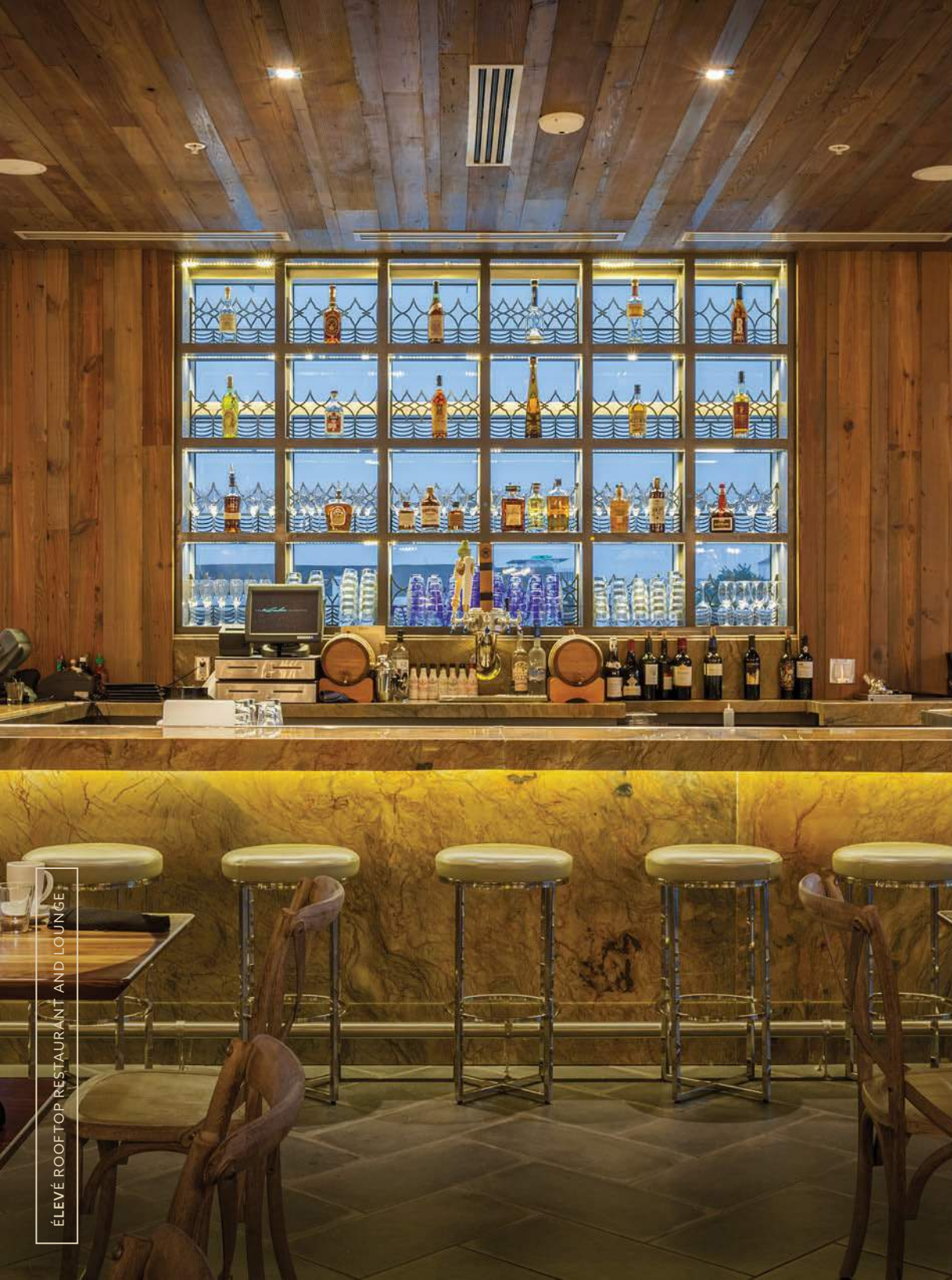
ÉLEVÉ ROOFTOP RESTAURANT AND LOUNGE