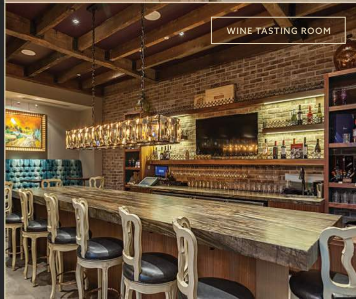
WINE TASTING ROOM