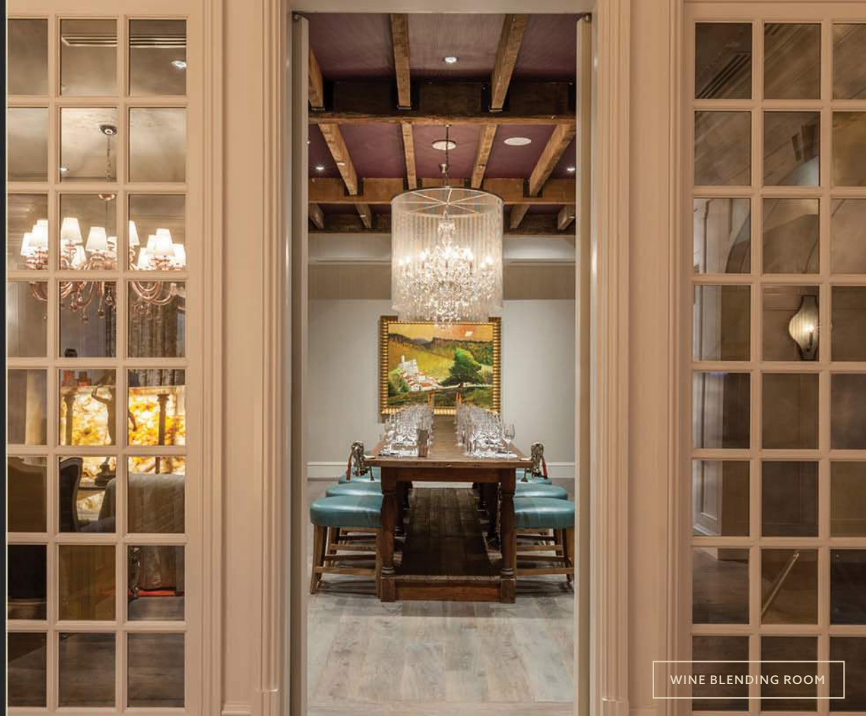
WINE BLENDING ROOM

From the lobby that greets you to the guest room you rest in and every hallway in between, we invite you to pause for a second, find what raises your pulse, try something different and share these moments together. Only Kessler delivers a hotel and art gallery full of original pieces, a spa experience, wine blending, wine tasting, live and curated music, incredible dining and destination adventures, all in one stay. Add any of these to the schedule and your day becomes much more than a meeting.