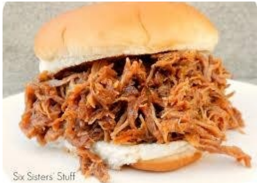
Six Sisters' Stuff

All food, beverage, catering, audio-visual services and any other services for your function are subject to a taxable 20% service charge. This service charge will be automatically added to your bill. As required by law, state sales and other applicable transactional taxes will be collected on the service charge. Under Federal Law, a service charge cannot be a tip and under State Law the Hotel is required to disclose that the service charge is not a tip and will be retained by the Hotel. Because of this, the employees participating in your function are generally compensated at rates well above minimum wage, so tipping of these employees is not necessary. However, in the case of exceptional service, please feel free to add a tip and 100% of such tip will be distributed to the employees on an established pooled tip basis or as directed by you. Tips are not subject to sales tax.