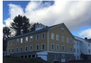
Tillyer House 28 Guest Rooms