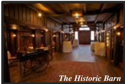
The Historic Barn