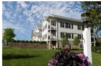
Chamberlain House 20 Guest Rooms