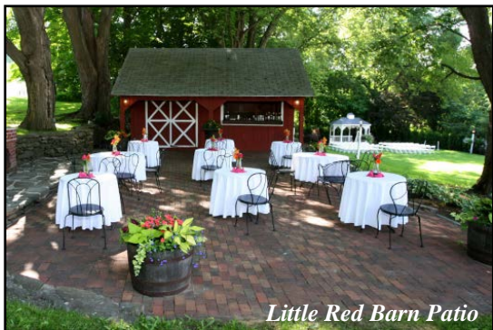
Little Red Barn Patio