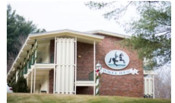
Country Lodge 63 Guest Rooms

Through the years, this historical destination has grown into a landmark in Sturbridge, Massachusetts, offering two charming restaurants that boast a dining experience from an era that has long passed with post-beam ceilings and old fashion fireplaces. We have 128 guest rooms with your choice of four lodging facilities all in a historical setting with private baths and air conditioning. The Historic Inn has 17 country guest rooms each with their own 18 th century décor, our newly renovated and expanded Chamberlain House now has 12 suites and 8 guest rooms, our newly built Tillyer House has 28 guests rooms, day spa and salon, and health club, and the Country Lodge has 63 guest rooms nestled on the hill with an outdoor pool!