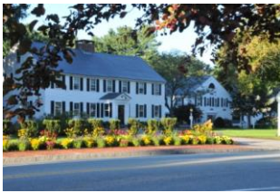
Historic Inn 17 Historic Guest Rooms

Located at the junction of I-84 and I-90 in Sturbridge, Massachusetts, the Publick House Historic Inn is just 20 minutes from Worcester, one hour from Boston & Rhode Island, and 45 minutes from Hartford.