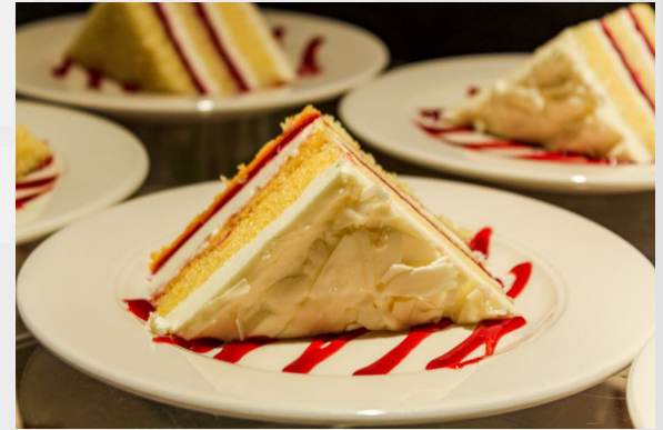
Raspberry Layer Cake

Creme Brulee Cheesecake (Gluten Free) - $7