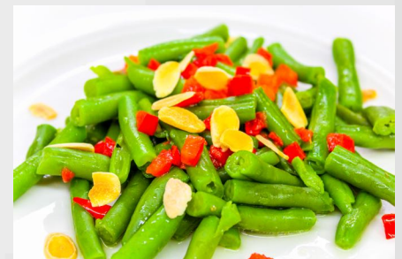
Green Bean Almondine