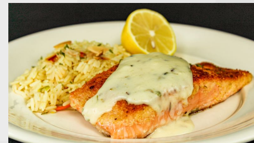
Pistachio Crusted Salmon

Grilled Jumbo Shrimp Served Over Rice Pilaf