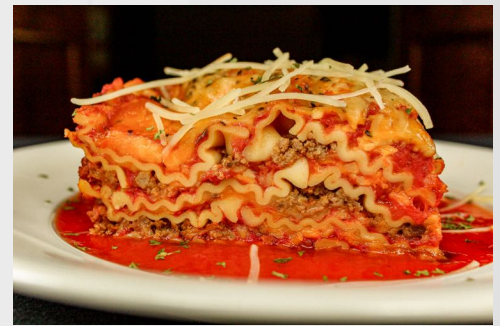
Meat and Cheese Lasagna

Spinach and Ricotta Cheese Ravioli Topped with Alfredo, Diced Tomatoes and Sauteed Mushrooms