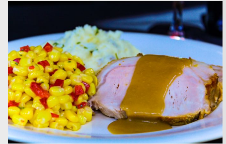
Garlic Roasted Pork Loin

Pan Fried Boneless Pork Chop Topped with Creamy Pesto