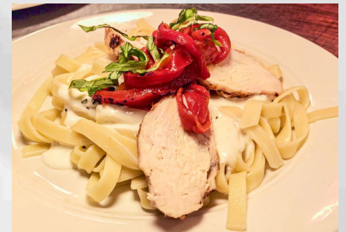
Chicken Fettuccini Alfredo with Peppers and Basil

Please Inquire About Off-Premise Availability and Pricing