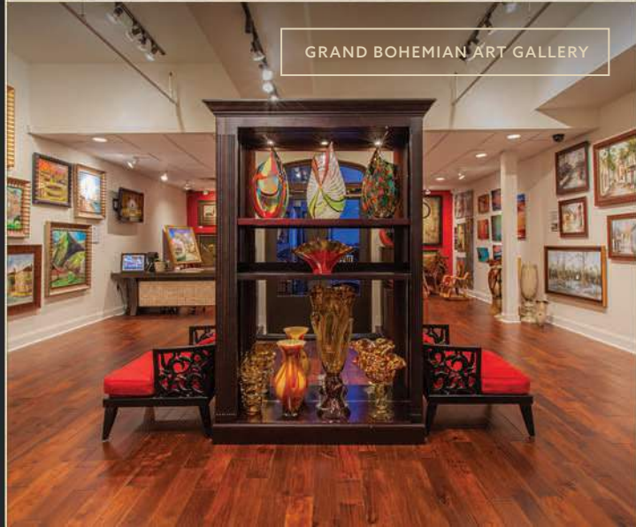
GRAND BOHEMIAN ART GALLERY