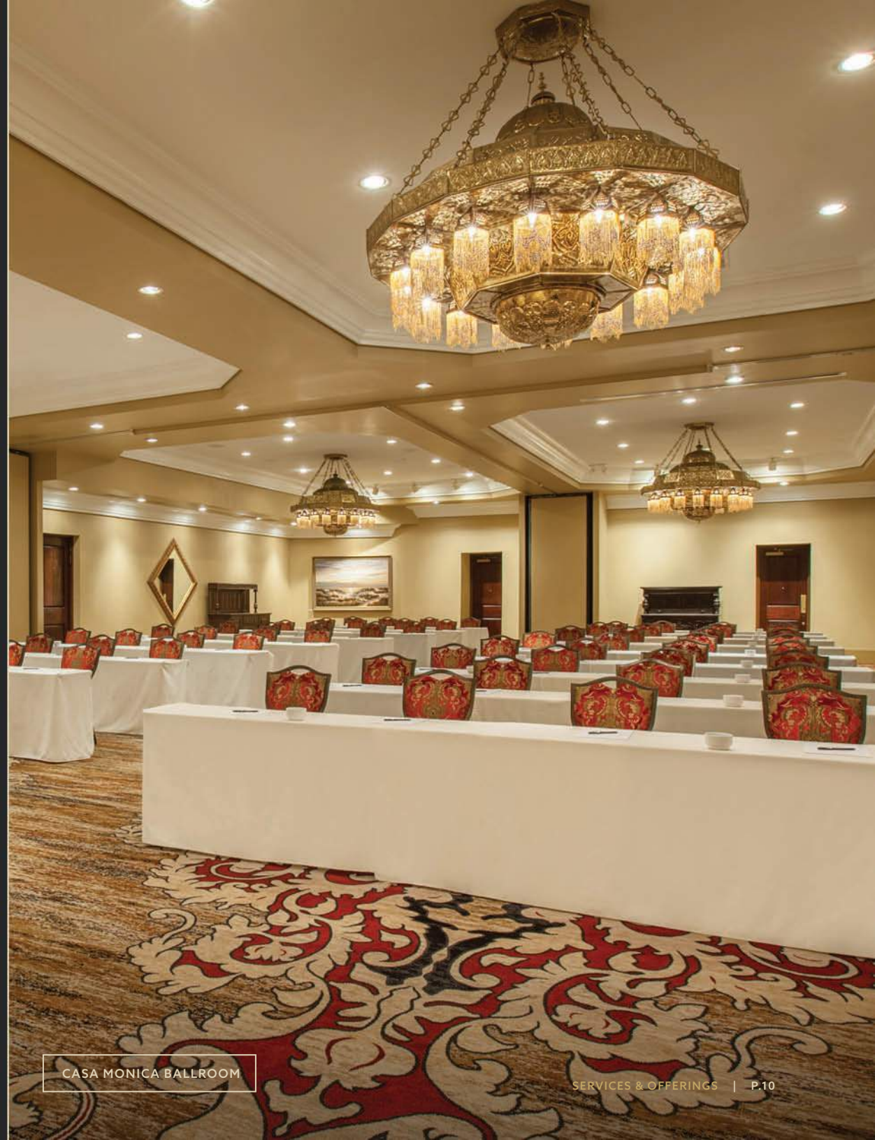
CASA MONICA BALLROOM

Take a look at our offerings and feel free to wander away from what you've always done. We would be delighted to create something unique and inspiring for your group. After all, extraordinary starts at the edges of your usual plans.