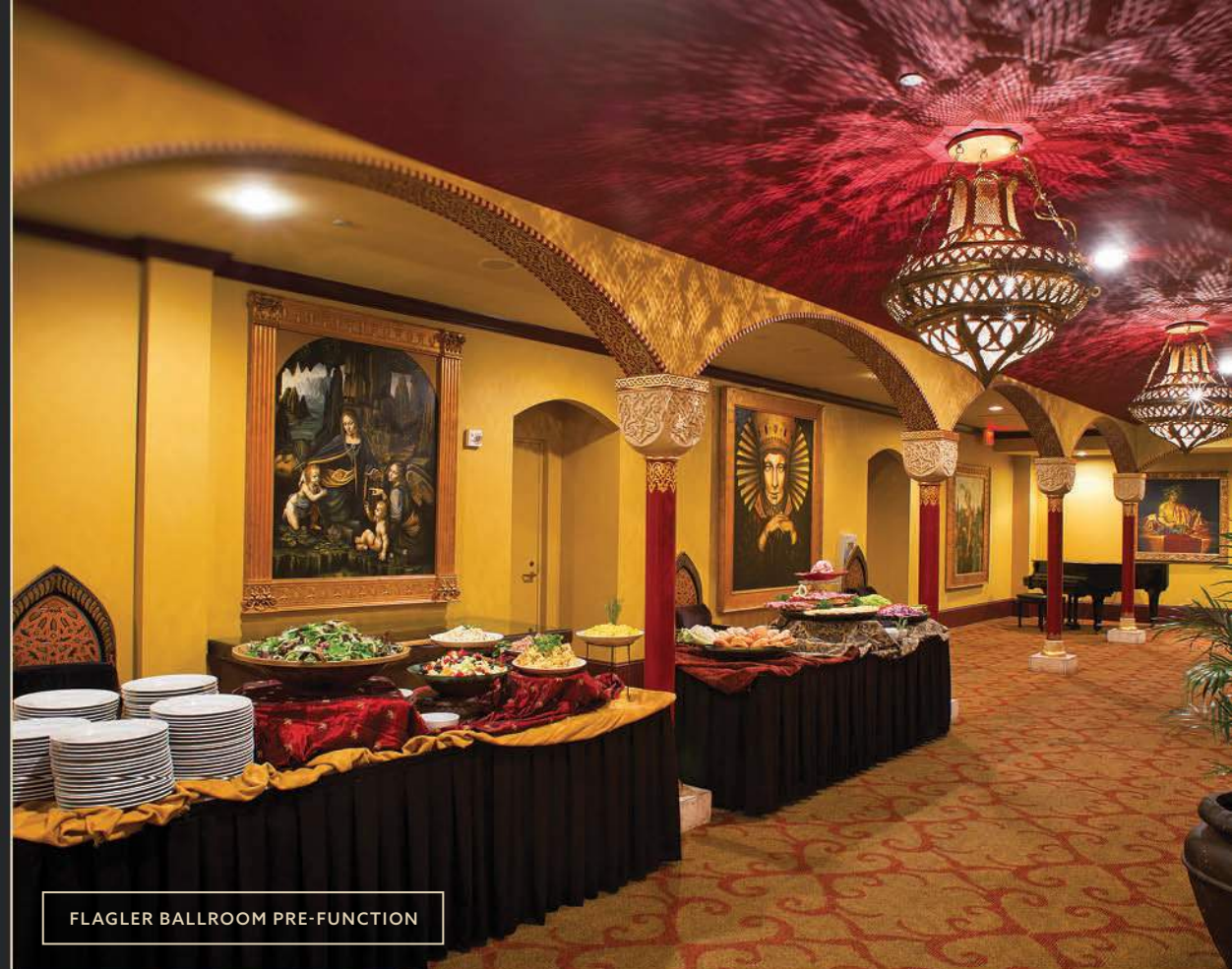
FLAGLER BALLROOM PRE-FUNCTION

Every finish, every chandelier, every piece of art on the wall and every chair you sit in was thoughtfully hand-selected with one intention in mind, to truly inspire our guests. When a small group gathers for a board meeting, a sales team joins forces, or a 300-member company celebrates a winning year, we give them the backdrop that brings their story to life. It's so much more than square footage. It's transcending from space to a feeling that your time together was exceptional.