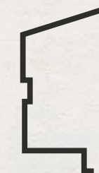
ALCAZAR ROOM (SECOND FLOOR)