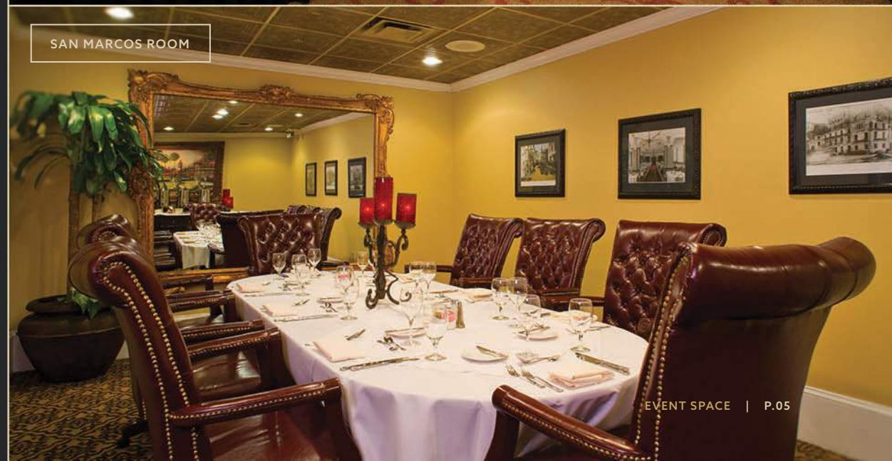
SAN MARCOS ROOM