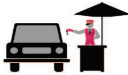
VALET PARKING $375