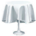
WHITE TABLE LINEN $7 EACH