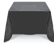
BLACK TABLE LINEN $5 EACH