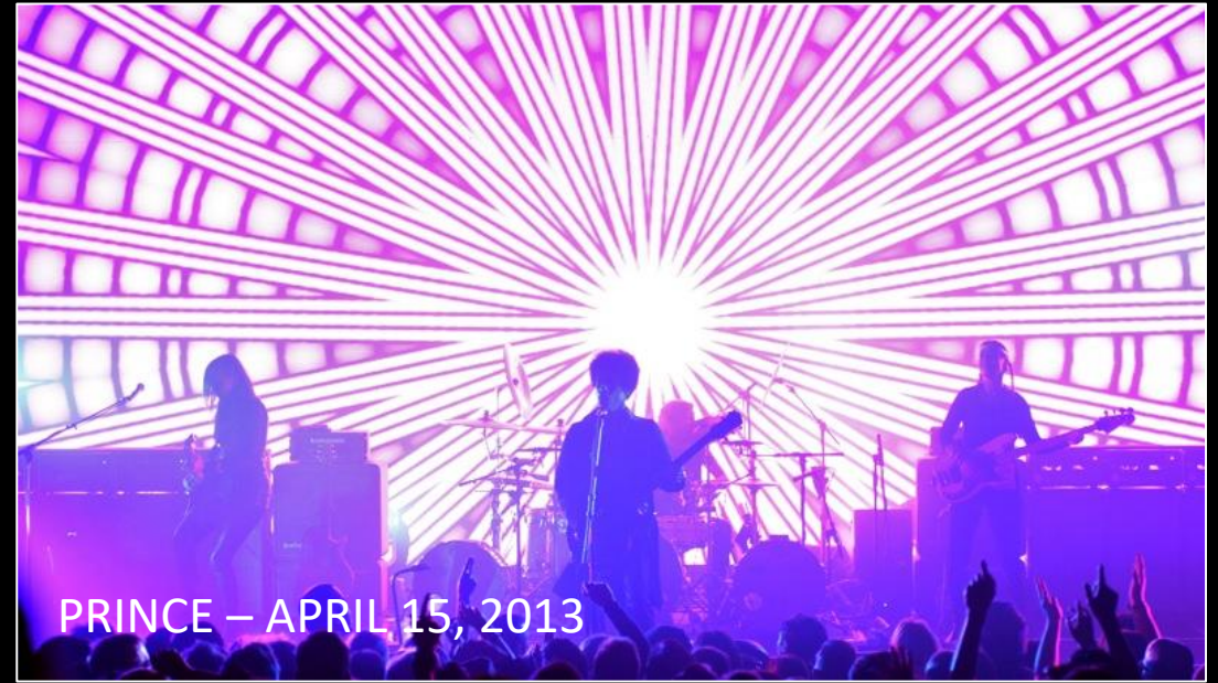
PRINCE – APRIL 15, 2013