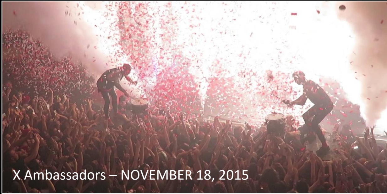
X Ambassadors – NOVEMBER 18, 2015