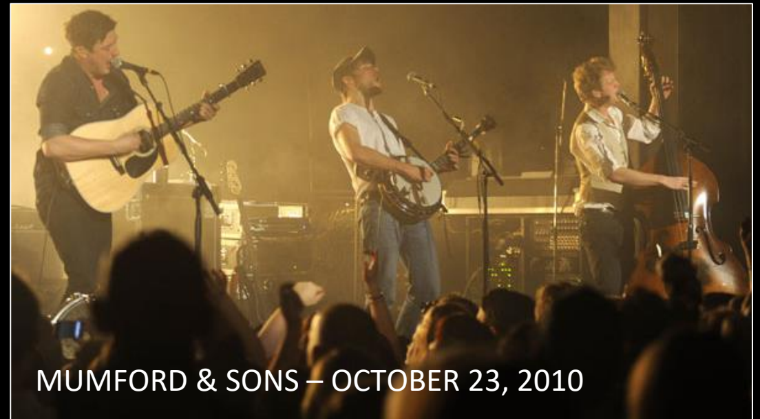
MUMFORD & SONS – OCTOBER 23, 2010

From local bands and DJ's to artists and performers, give us your vision, and we can make it happen.