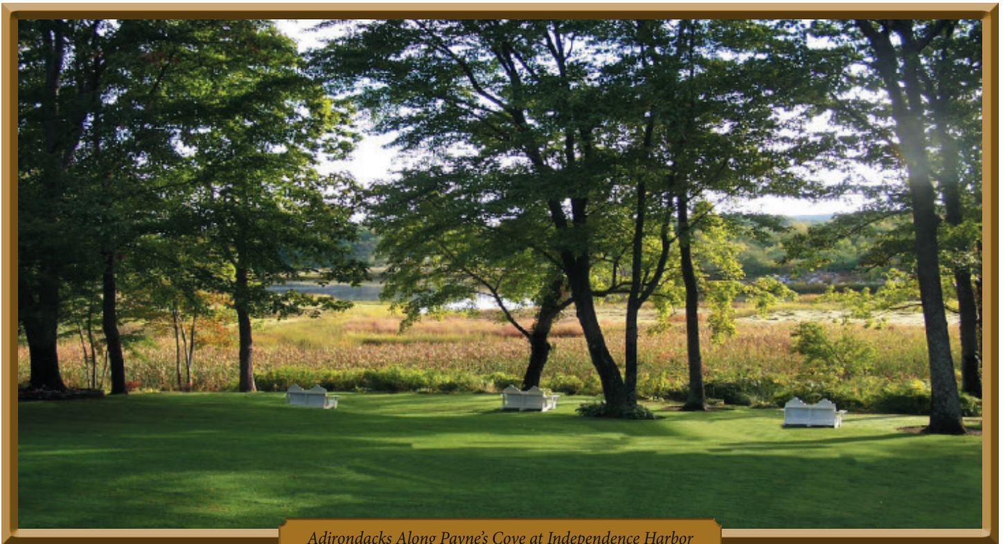
Adirondacks Along Payne's Cove at Independence Harbor