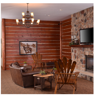
{\it Stoney Creek Hotels.com}