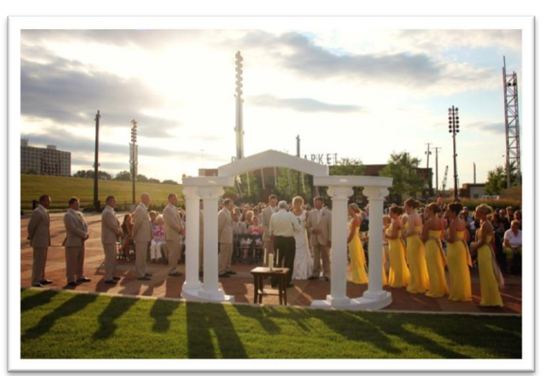
Expo Plaza