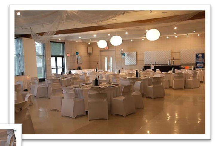
2E, Schoitz River Rooms