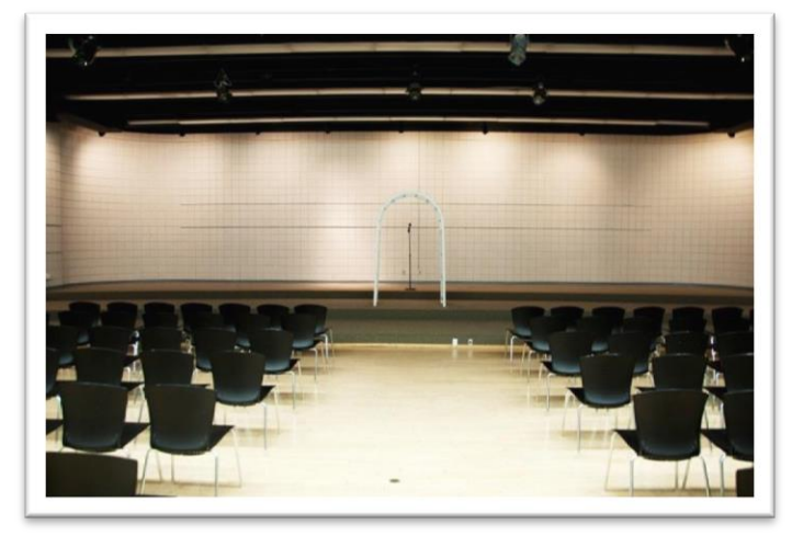
2F, Town Hall