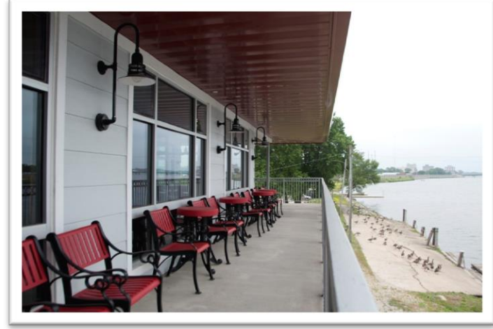
2D, Boat House Exterior