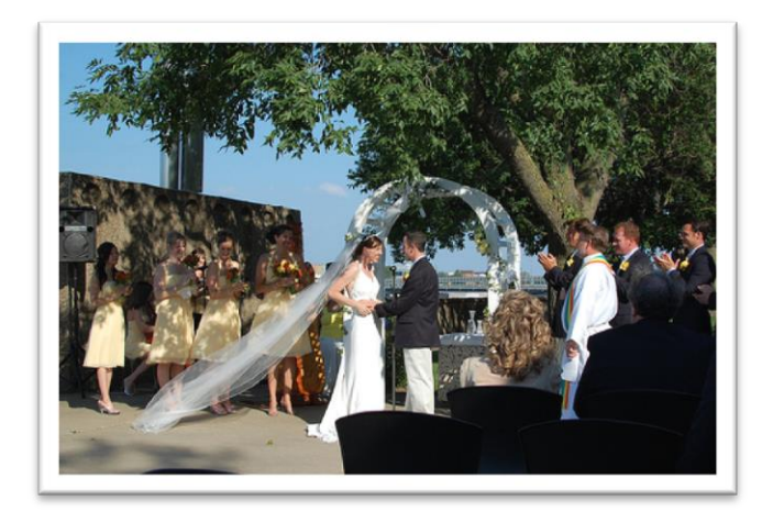
1A, Schoitz Patio