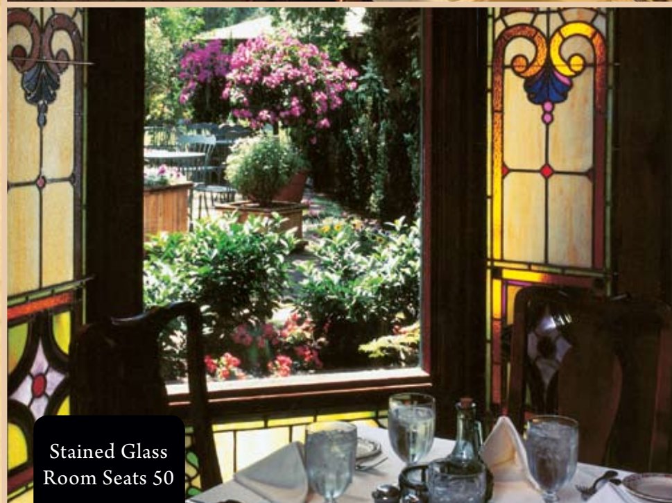
Stained Glass Room Seats 50