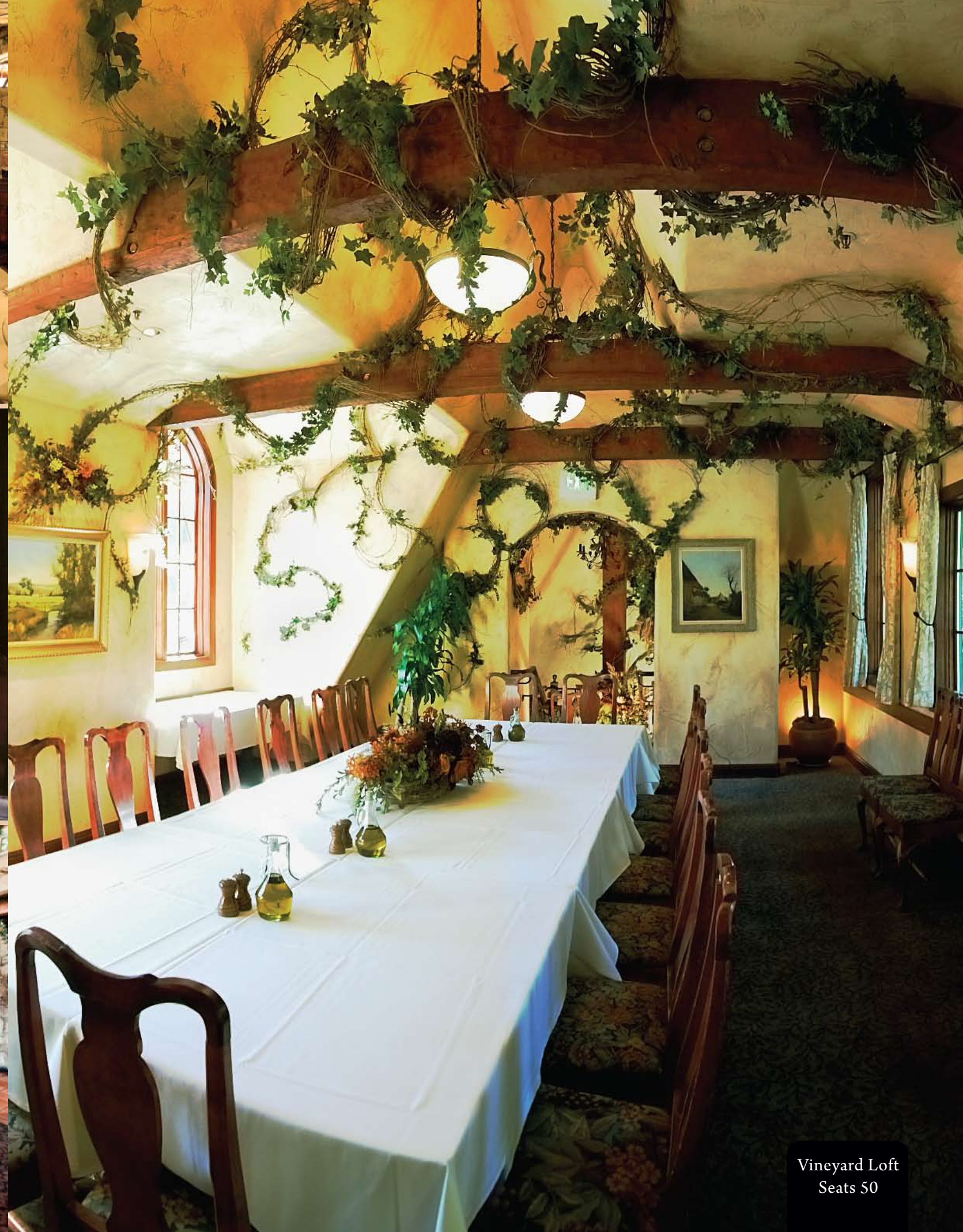
Vineyard Loft Seats 50

For more details visit www.tuscanyslc.com/dining