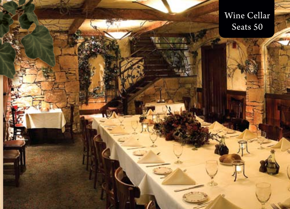
Wine Cellar Seats 50

Experience one of the charming Tuscan-inspired dining rooms or slip out into the aria fresca on one of three breathtaking patios. Multiple levels of dining can accommodate from 10 - 600 guests, with large and more intimate dining areas, each unique and spectacular. Tuscany's graceful, tree-shaded Italian courtyard patio gardens provide Salt Lake's finest outdoor entertaining areas in a natural, intimate setting. Incredible stone and wrought iron work is evident throughout, while a massive hand blown glass chandelier graces the entry foyer. Our wedding gazebo, a stately arrangement of ionic columns on the south lawn patio provides a classical backdrop to the towering views of the Wasatch front in a lovely wooded setting. We have the perfect venue for your every occasion.