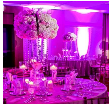
O'Hare Ballroom Wedding