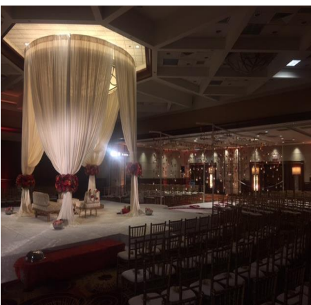
Grand Ballroom Ceremony