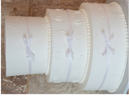
White Dots & Bows