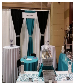
Bridal Expo 2014 as one of the vendors for Urban Events .

We pride ourselves on being professional. This means we aren’t on time, we are early. We are courteous and respectful to all of our client’s guest, because we want these same people to be our clients next time. And we are prepared. We understand that little hiccups happen within